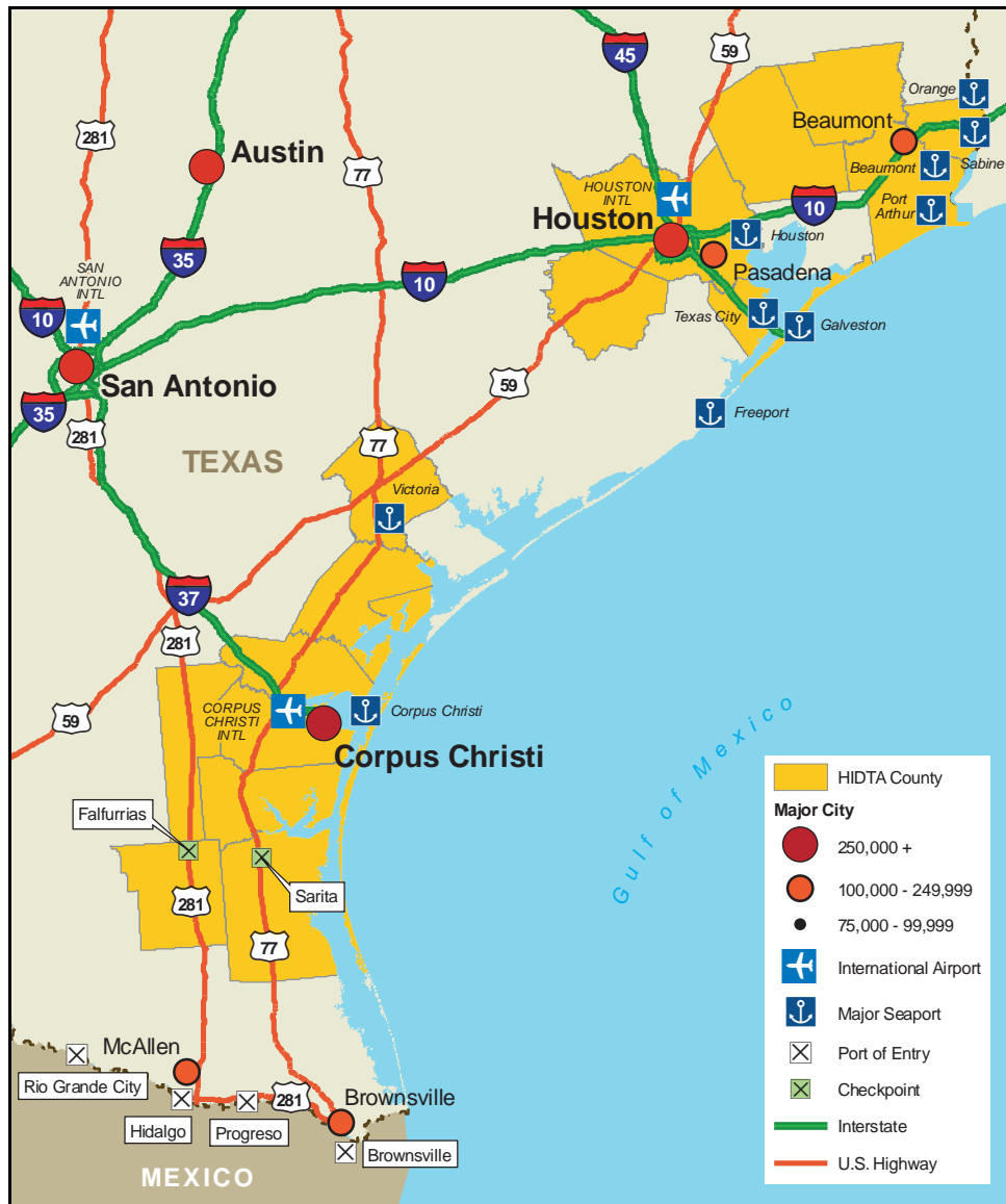
Figure 2. Houston HIDTA transportation infrastructure.