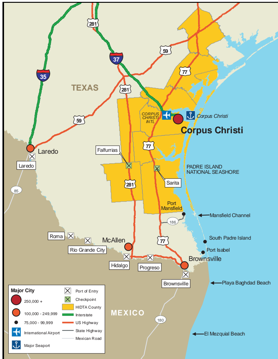
Figure 3. Padre Island National Seashore.

DTOs commonly smuggle cocaine, marijuana, and illegal aliens to the PINS by shark boats, 7 or “lanchas.” DTOs hire fishermen in Mexico to use their boats to smuggle contraband into the PINS; some Mexican fishermen may be particularly susceptible to recruitment by traffickers, since the Mexican fishing industry has collapsed as a result of overfishing and loss of fishing grounds. Shark boats typically depart from Playa Baghdad and El Mezquial, Mexico, approximately 20 miles south of the U.S.–Mexico border on Mexico’s east coast. It is common for 10 to 20 shark boats loaded with