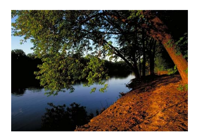
Mississippi River Visitor Center (Lobby, Science Museum of Minnesota) 120 West Kellogg Blvd. Saint Paul, Minnesota 55102

We hope you enjoyed this walking tour. To learn more about other fun activities along the Mississippi River, please visit www.livetheriver.org.