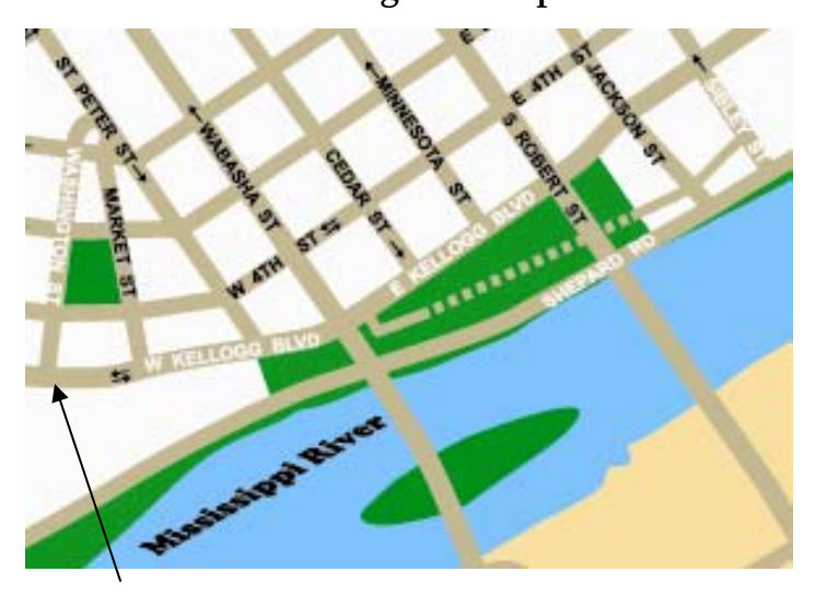
Science Museum of Minnesota