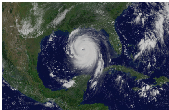
Hurricane Katrina Satellite View.