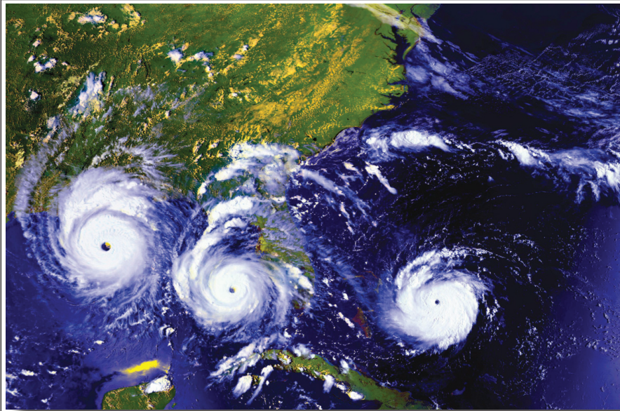
Three views of Hurricane Andrew on 23, 24, and 25 August 1992 as the hurricane moves East to West. Time lapse satellite image courtesy NASA.