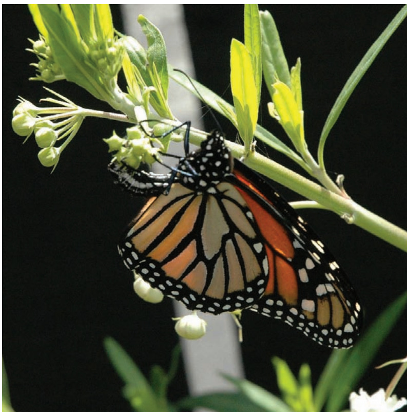
Monarch butterfly laying eggs.

The Monarch butterfly is regarded by many as a beautiful creature so when a report suggested that pollen from genetically-engineered Bt corn might kill Monarch butterfly larvae, scientists from USDA/ARS and numerous universities teamed up to assess the potential risk. The original report showed only that Bt-containing pollen fed directly to Monarch larvae is toxic but did not address exposure in the field. Outcomes from intensive studies suggest several reasons to believe that risk is minimal. Corn pollen does not move very far from cornfields in significant amounts and it tends not to accumulate on the leaves of the milkweed plants that the Monarch larvae actually eat. In addition, the timing of pollen production is offset from the time when the larvae are feeding most actively. These risk assessment studies have contributed to the EPA's decision to continue to allow Bt corn to be grown in the United States.