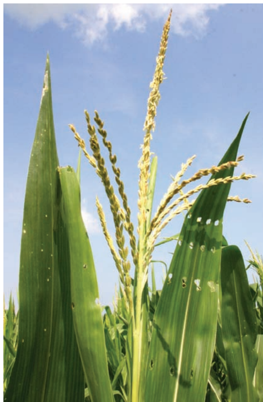
Stamens of the corn male flower (tassel) shed pollen.

Dr. Mark Westgate (Iowa State University, Ames) is studying the production and movement of corn pollen under the corn growing conditions typical of the Midwestern U.S. This is the first time that a study of the production and dispersal of transgenic pollen has been coupled with a prediction of out-crossing to an adjacent field. Westgate and colleagues used a particle dispersion model to predict the pattern of pollen flow from genetically-engineered corn to adjacent fields of non-transgenic corn. Particle dispersion models compute pathways for a large number of individual particles (pollen in this case) to describe the transport and diffusion of substances in the atmosphere. The researchers' results clearly demonstrate that potential for gene flow in corn can be assessed from the flowering dynamics of the crop. They also confirmed that this approach for predicting pollen dispersal provides a fairly accurate profile of pollen deposition for up to about 300 meters from the pollen source. Movement of pollen is a critical metric in instances where genetic purity of breeding lines is required and in cases involving experimental use permits.