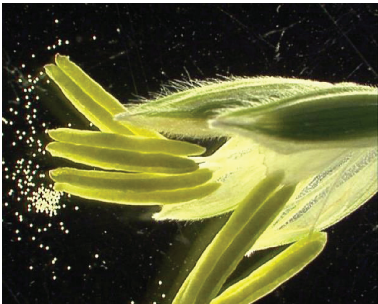
Corn anthers shedding pollen.

Aerial movement of corn pollen is problematic for those seeking to maintain genetic purity during seed production or to preclude unintended movement of transgenes into food or feed corn. Dr. Don Aylor (Connecticut Agricultural Experiment Station, New Haven) is using remote-control model aircraft to sample air at varying levels above the corn crop canopy and ground-based samplers for within-canopy measurements of pollen content. The model takes into account the ability of pollen to germinate (survive) after dispersal, various atmospheric factors, and corn silk and pollen geometry to assist prediction of the likelihood of pollen deposition and hybridization with a receptive plant. This study should provide regulators with a more accurate and realistic model to describe corn pollen movement away from a field and thus to set isolation distances for segregating corn lines. The final model will allow for predictions of pollen movement over distances of less than one meter to over ten kilometers.