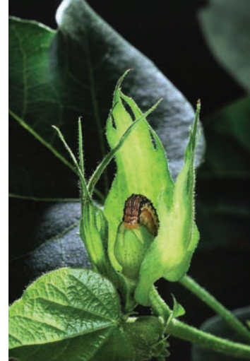
Cotton bollworm eating a boll.

It has been known since the introduction of dichloro-diphenyl-trichloroethane (DDT) that insect pests can develop resistance to chemical insecticides. Will the Bt trait genetically engineered into crops suffer a same fate? USDA/ARS is monitoring the resistance of cotton insect pests to Bt cotton in order to alert the EPA in the event that resistance begins to occur. USDA/ARS is also conducting research to determine the best management practices to prevent resistance from occurring, with an emphasis on the cotton bollworm. The monitoring has shown no significant change in resistance over the eight years that Bt cotton has been planted commercially, supporting the EPA's decision to extend the registration of Bt cotton for a second five-year period.