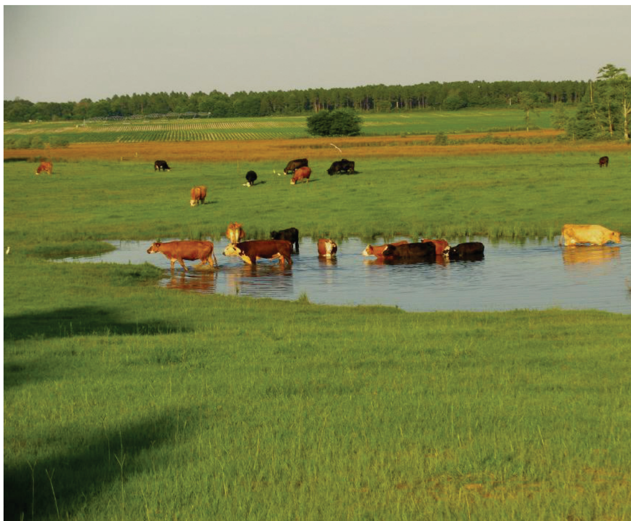
Bahiagrass is a popular forage grass in the southeastern U.S.

Bahiagrass ( Paspalum notatum ) is the most widely-grown forage grass in Georgia, Alabama and Florida, and is also cultivated as a turf or utility grass. Pollen production could lead to the unintended spread of transgenes, so Dr. Fredy Altpeter (University of Florida, Gainesville) is determining the extent of pollen-driven gene flow in this grass, as well as developing methods to prevent transgene movement. One possible approach is to create male-sterile plants that do not produce viable pollen. Insertion of the transgenes into the chloroplast genome is also being explored to prevent transgene movement through pollen, since chloroplast genes are generally inherited maternally.