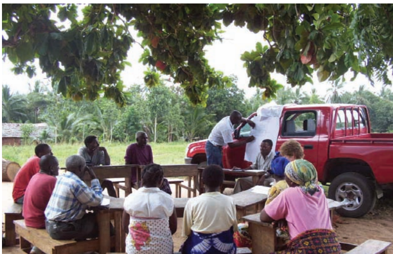
Farmers discuss unique corn varieties on the coastal lowlands of Kenya.

East Africa is the largest banana-producing and consuming region in Africa. In the highlands, native banana varieties are used for cooking. Farmers use the cooking bananas to feed their families, selling