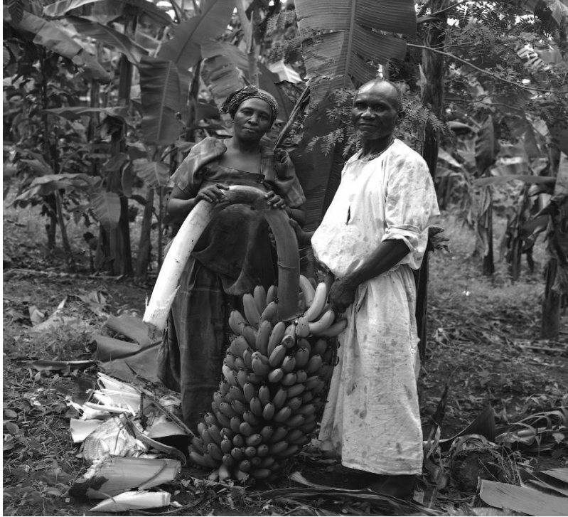
Both men and women participate in banana production and sales in Uganda.

nology products to occur. The analysis estimated the overall potential impact of the technology, as well as the distribution of the impacts across social groups, including consumers.