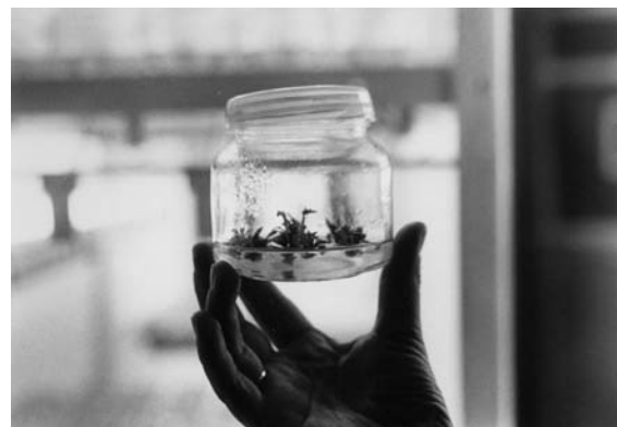
In vitro banana propagation.

IFPRI has combined extensive agricultural production and market information with farmer surveys and geospatial data to capture the diversity of factors that might influence farmers' decisions and simulate farmers' responses to the introduction of a biotechnology variety intended for adoption by smallholder agricultural systems. Analysis of data from field interviews with farmers reveals their perceptions as well as the impediments that must be overcome for widespread adoption of biotechnol-