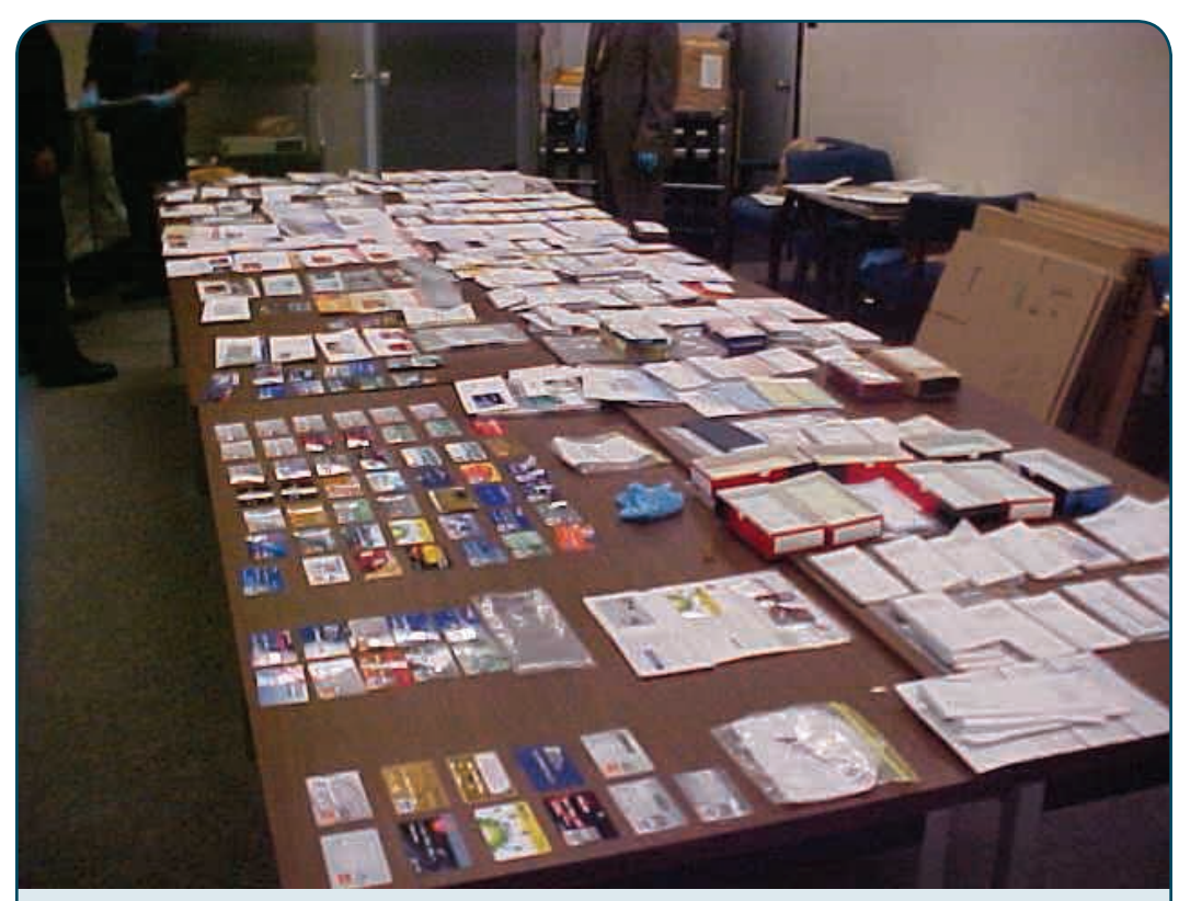
Partial display of credit cards, checks, and identifying documents seized in federal investigation of identity theft ring in Maryland, 2005.

Progress is being made in reducing the opportunities that identity thieves have to obtain personal information in these ways. The Fair and Accurate Credit Transactions Act of 2003 (FACT Act)<sup>14</sup> requires merchants that accept