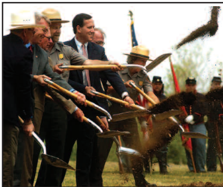
A celebratory groundbreaking took place in June 2005.

Phase one of the construction was the restoration of historic Guinn Run, a stream that runs through the museum site.