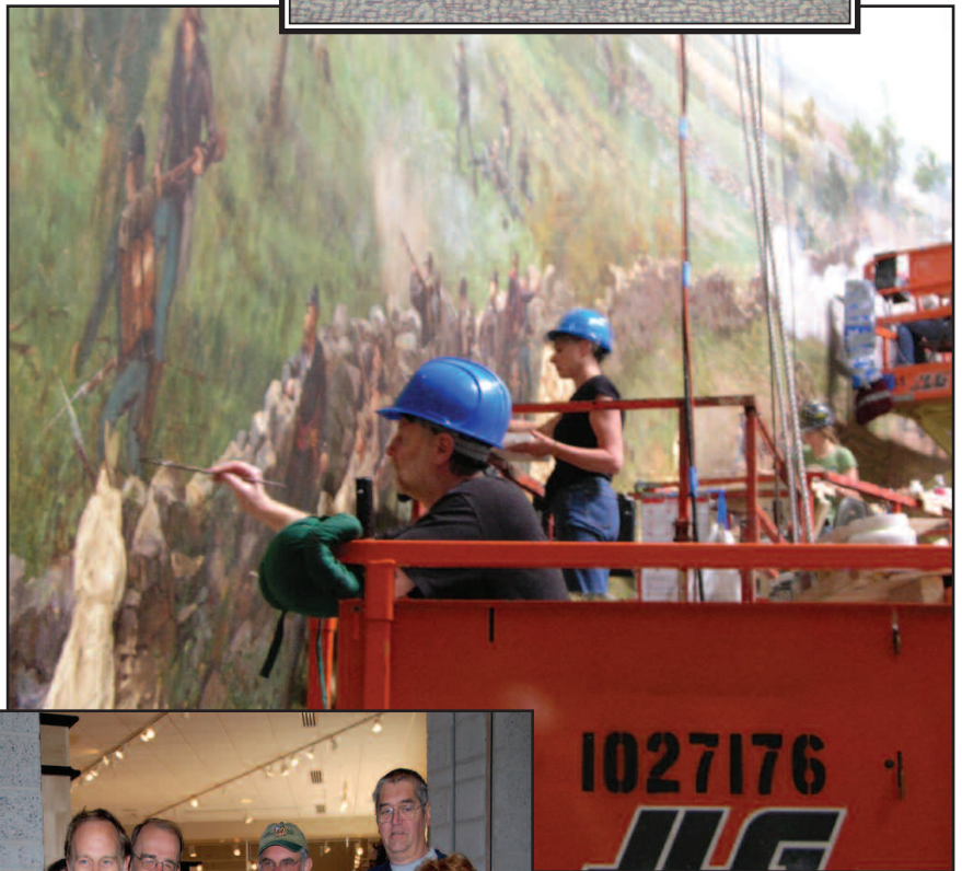
Above: Painting conservators put final touches onto the massive 1884 oil painting of Pickett's Charge known as the Gettysburg Cyclorama.

For more information go to www.gettysburgfoundation.org or www.nps.gov/gett .