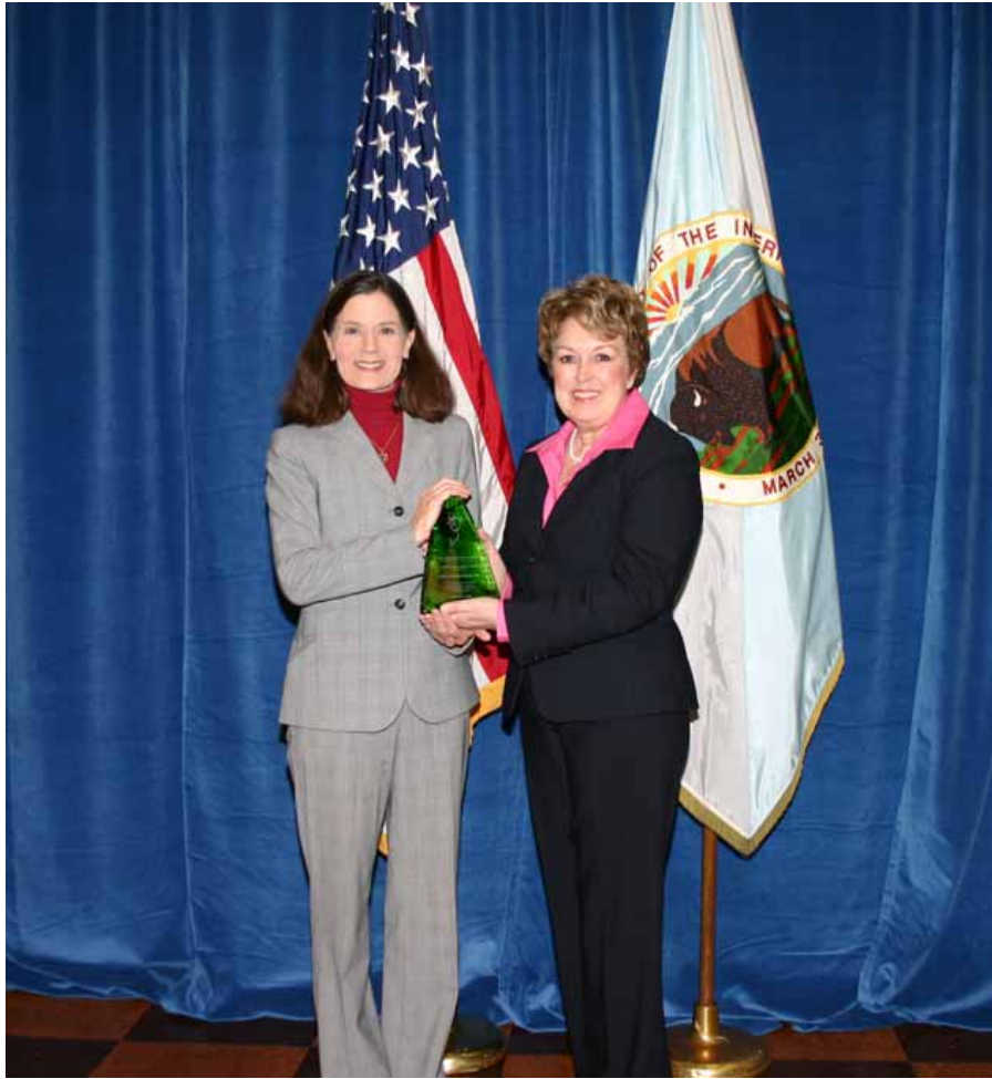
Xanterra Parks & Resorts: Lynn Scarlett, Mary Bomar