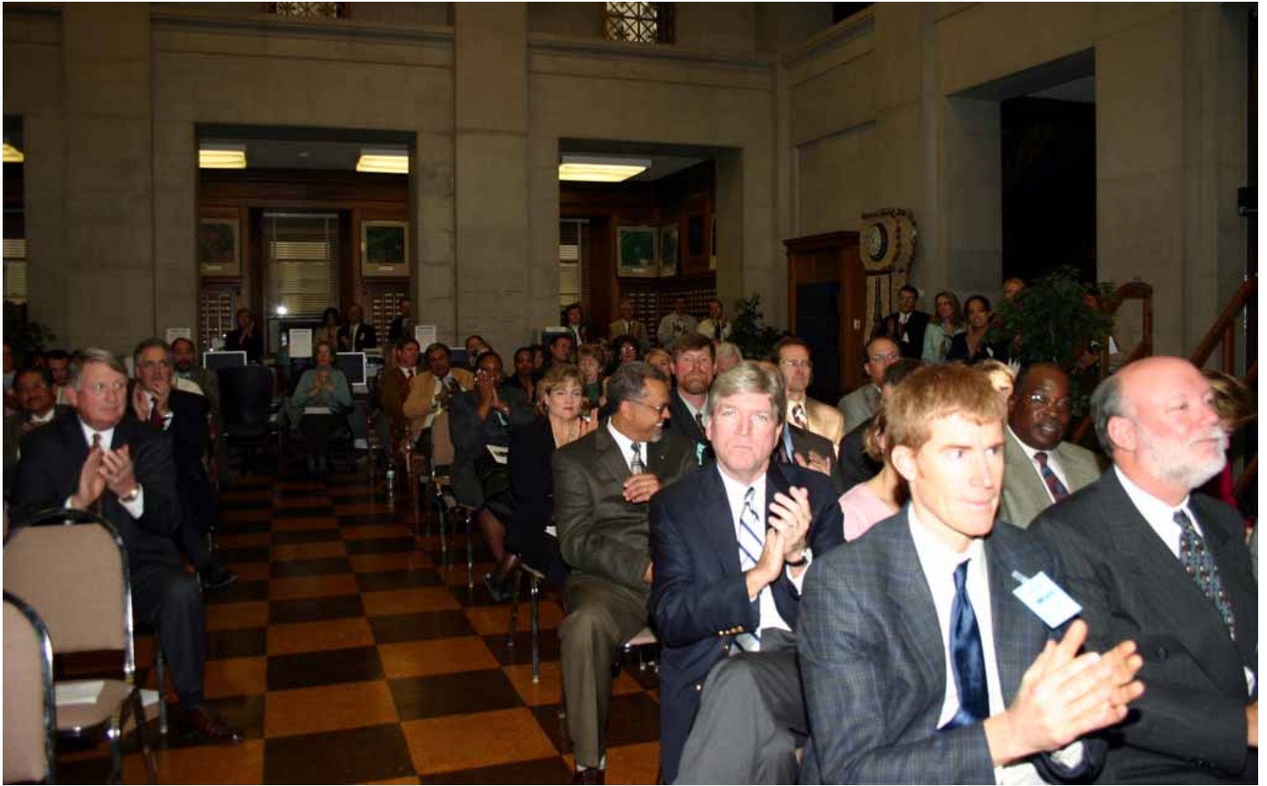
Award recipients and ceremony attendees in the Interior Library