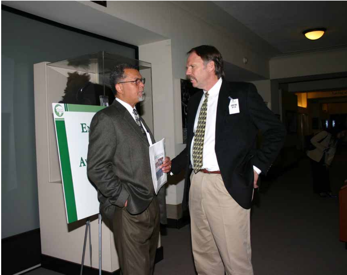
Recipients converse in the Interior Museum