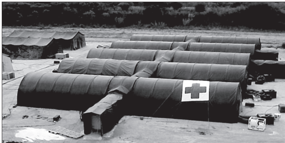
Figure 3: Collectively Protected Expeditionary Medical Support

Collective protection for larger expeditionary hospital operations is provided by large portable tent systems with liners and pressurized interiors, which may be combined to provide 200 to 300 beds or more. The Army, Navy, and Air Force all have versions of these mobile hospitals (see fig. 3). However, while the Air Force generally met its goal, shortages and other serious problems continue to affect Army and Navy medical facility collective protection.