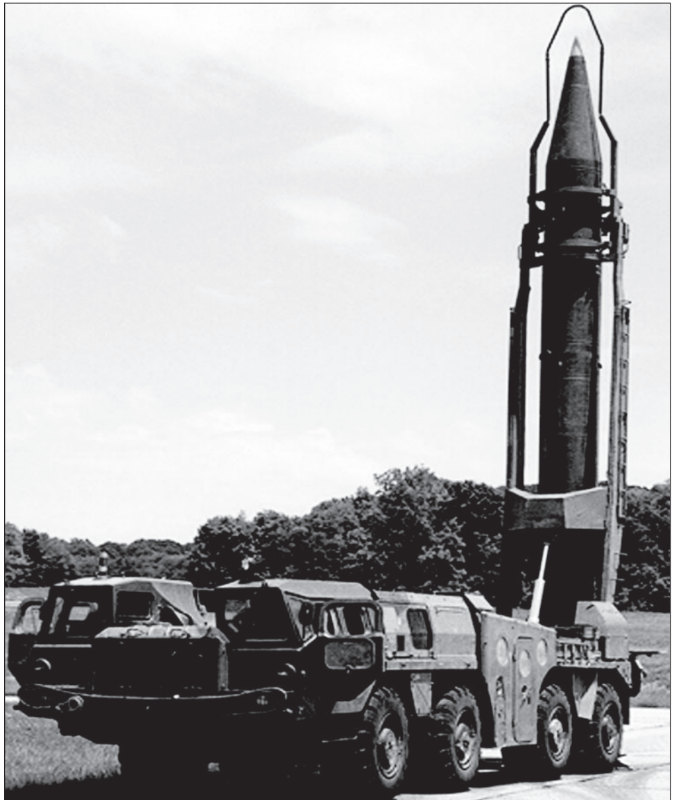
Figure 1: SCUD B Missile with Launcher