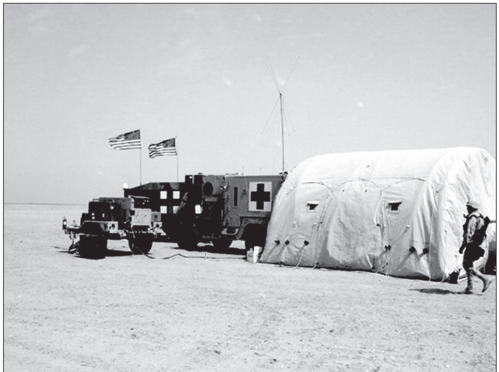
Figure 2: Chemical and Biological Protective Shelter

have these systems. According to Marine Corps officials, avoidance and decontamination strategies are their preferred method for handling chemical or biological events while operating on the battlefield. In addition, according to DOD officials, the Marine Corps often moves in small air and sea transports with little room for collective protection equipment, consistent with its traditional strategic mission. As a result, Marine Corps units may use Army medical support in the areas where they are deployed. However, the increasing use of joint operations, where both operate in the same geographic area at the same time, may be blurring traditional missions.