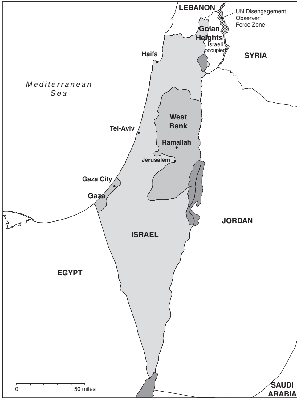
Figure 1: Map of West Bank and Gaza and Surrounding Countries