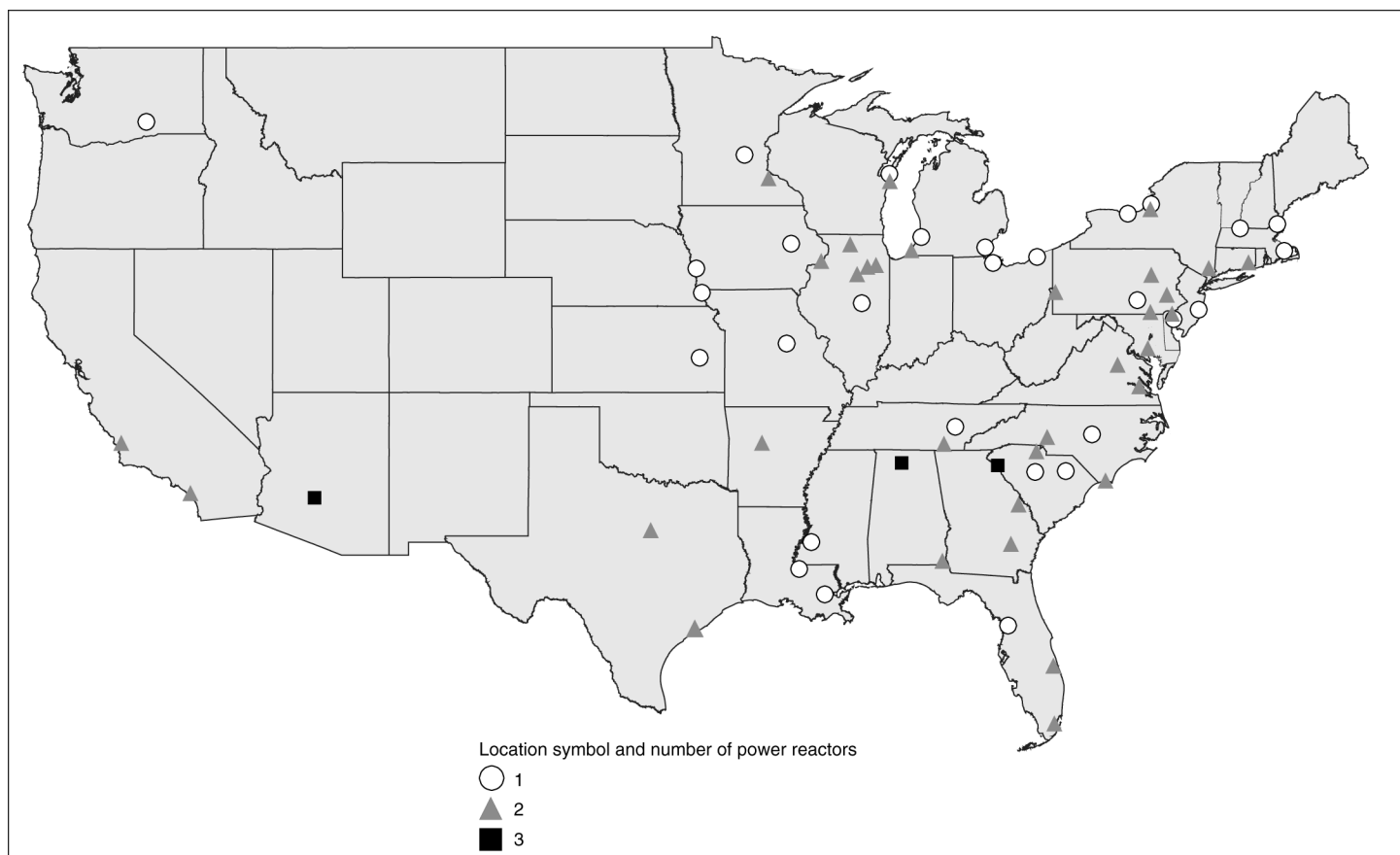
Figure 1: Commercial Nuclear Power Plants in the United States

implements its programs through four regional offices. Figure 1 shows the location of commercial nuclear power plants operating in the United States. (See app. II for a list of the commercial nuclear power plants, their locations, and the NRC regions that are responsible for them.)