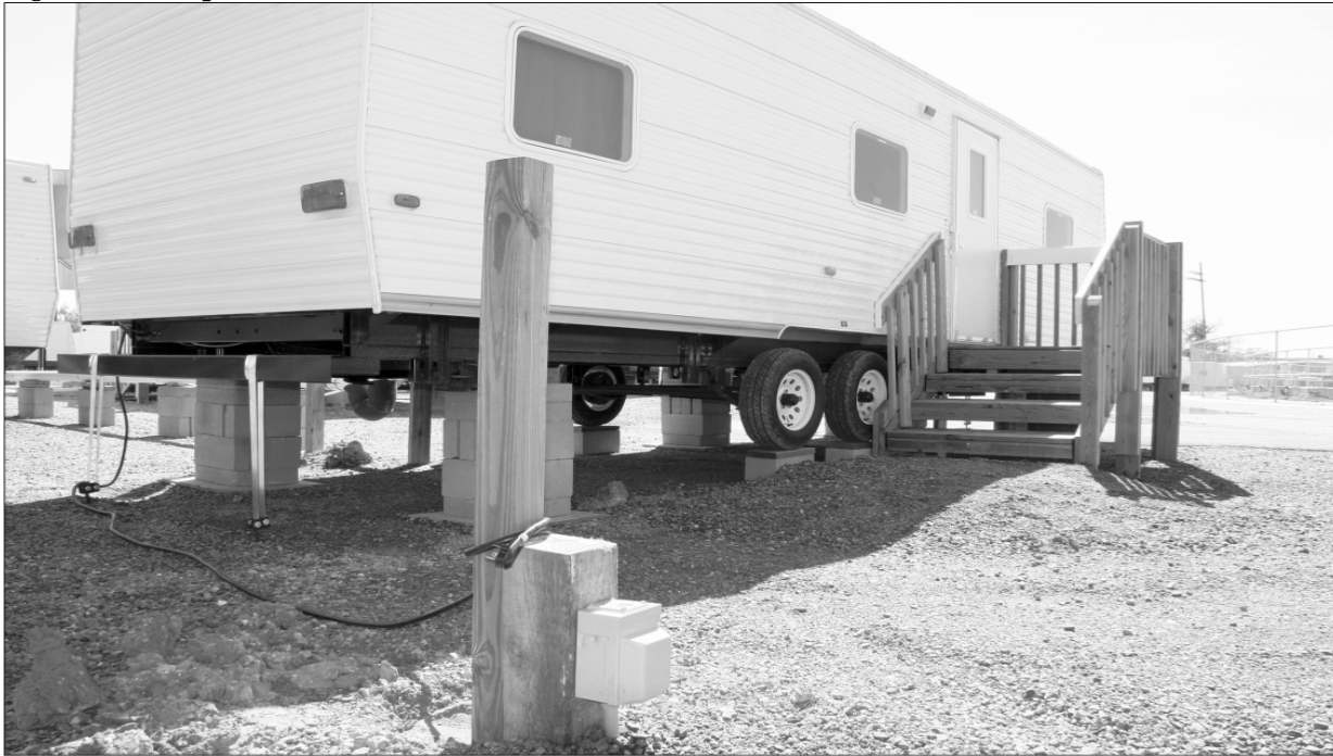
Figure 1: Example of FEMA Travel Trailer