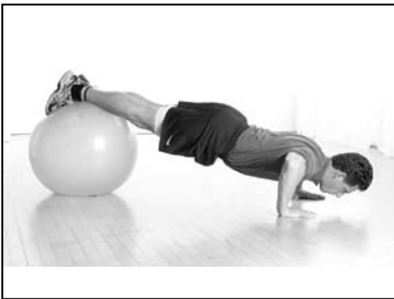
Figure 4. Elevated feet Push-up using stability ball