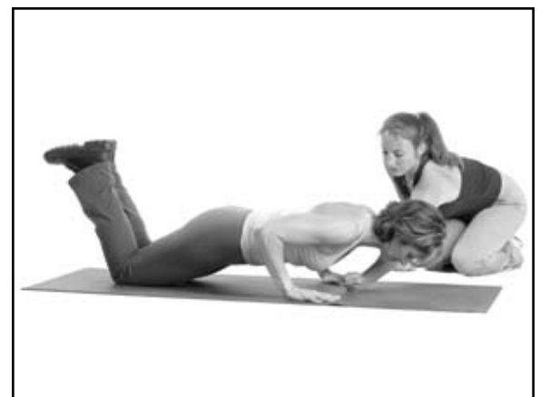
Figure 5. Push-up from knees

Note: This is a training exercise. All applicants (male and female) will be required to perform standard push-ups (figure 1) during the PFT.