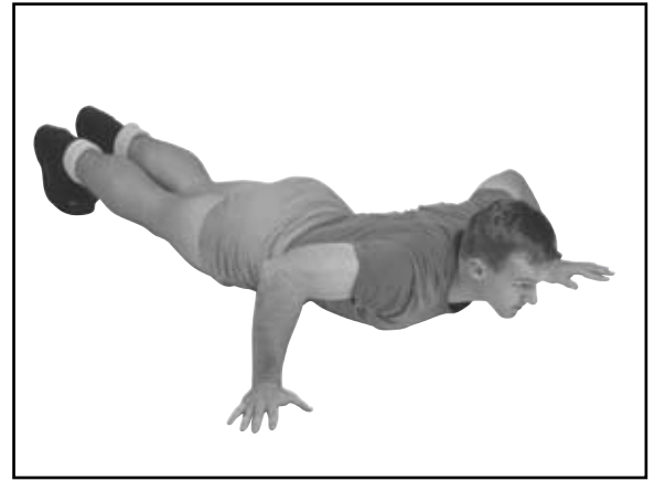
Figure 2. Push-up with wide hands