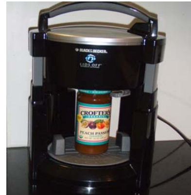
Figure 3. The “Lids-Off” jar opener, developed with NIDRR funding and marketed by Black and Decker.

New activities that are being proposed for 2009 include shifting additional funds into support for research and other activities to improve employment outcomes for individuals with disabilities. Other highlights are discussed below.