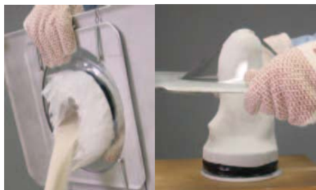
Figure 1. The CIR Prosthetic Casting System.

NIDRR-funded technology research has led to a wide range of technological improvements to aid individuals with disabilities. Grantees conduct research to improve everything from specialized prosthetics to everyday appliances. Recent examples include a wide range of new technologies. One Rehabilitation Engineering Research Center (RERC) grantee developed the "CIR Prosthetic Casting System," which offers a