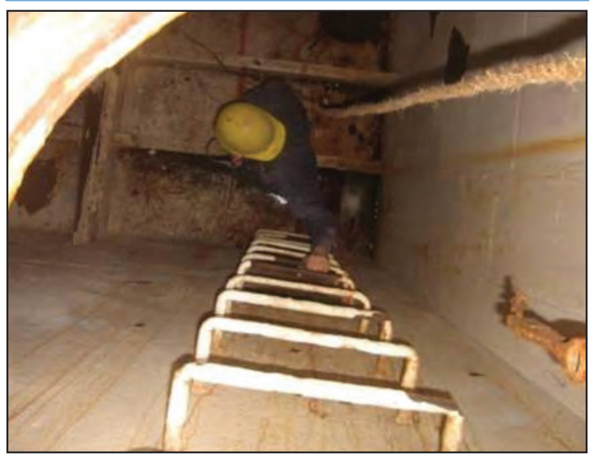
Photograph shows an employee entering a confined space.