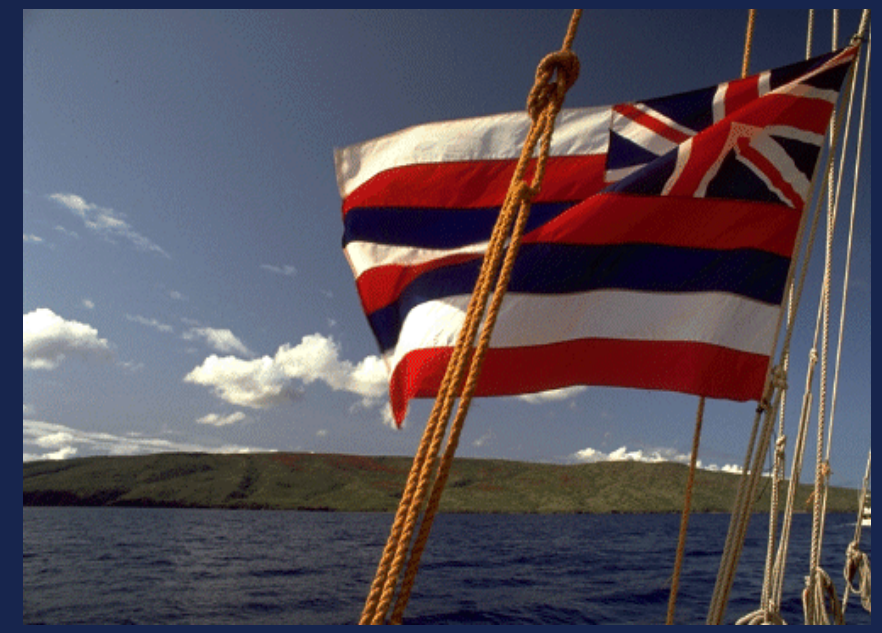
"HE ALI`I KA `AINA, HE KAUA KE KANAKA." LAND IS THE CHIEF, MAN IS THE SERVANT -'OLELO NO 'EAU