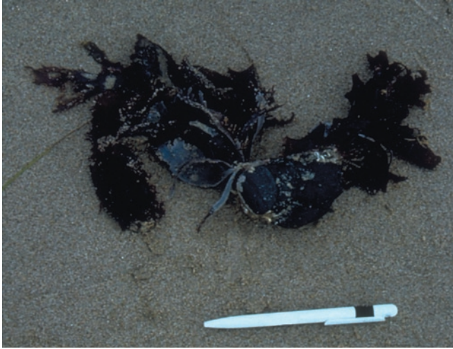
Kelp attached to weathered oil or "tarballs"