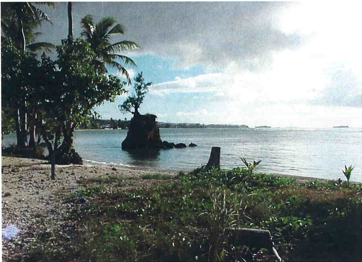
Plate 16 Apaca Point, part of the Agat Beach Unit. The Agat landing beach is along the coast just above the large rock. This section includes a picnic area.