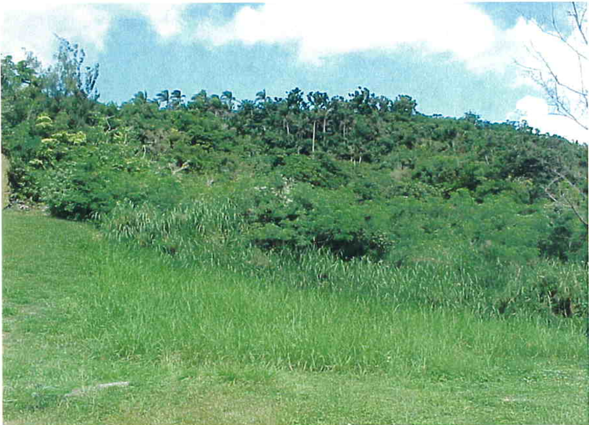
Plate 8 Mangan Quarry, which is located adjacent to the bunker shown in Plate 7, includes one of the best examples of native limestone forest on the island.