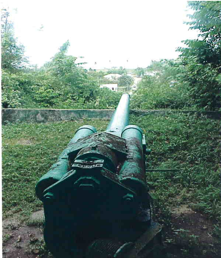
Plate 12 One of the three Japanese coastal defense guns located in the Piti Unit