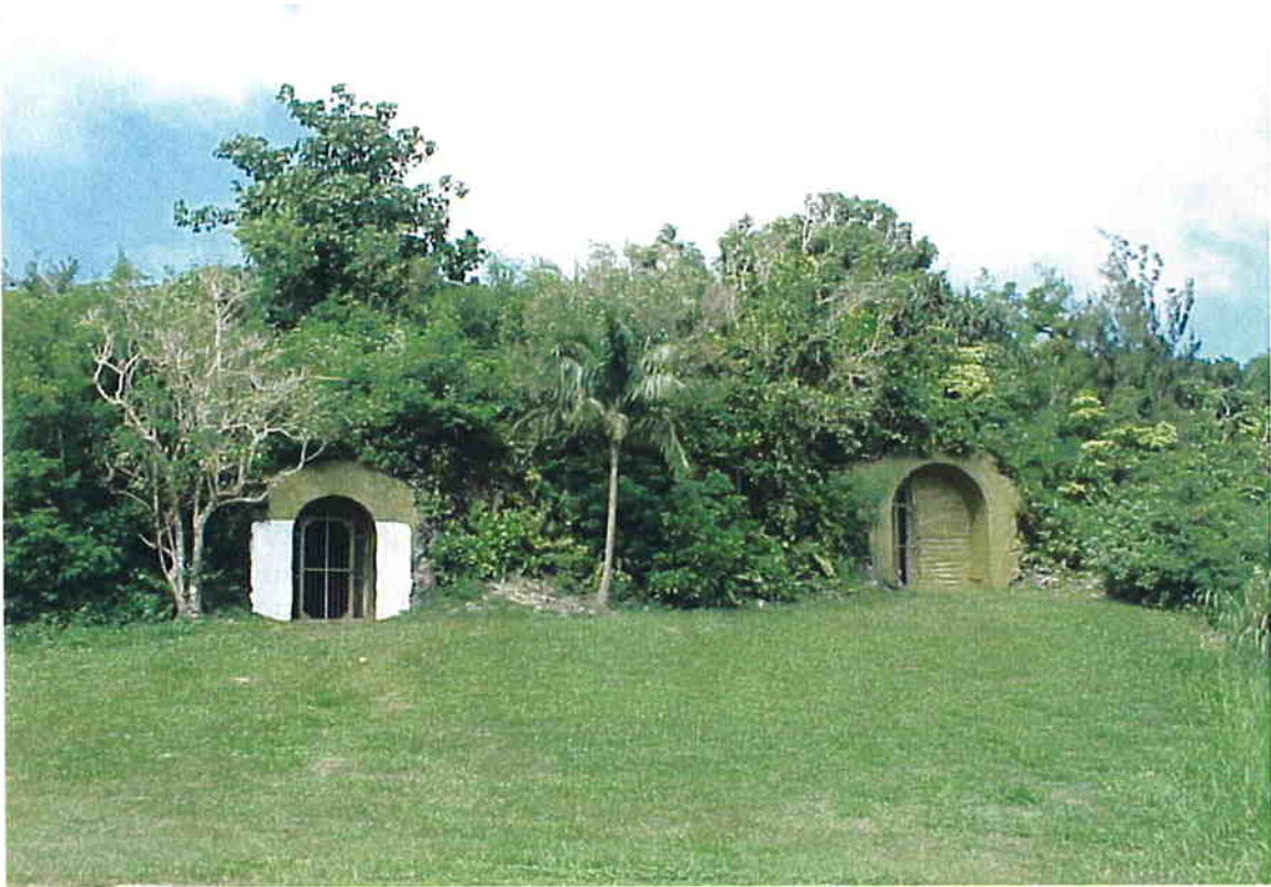
Plate 7 General Takashina's headquarters bunker on Fonte Plateau. There is a considerable variation of vegetation in this unit where forest and savanna meet.