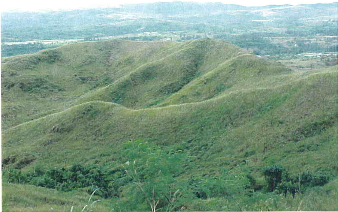
Plate 14 An example of the savanna around Mount Tenjo, note the Ravine forest at the bottom of the the picture. The sawgrass that covers these hillsides has the height and mass of that shown in Plate 13, above.