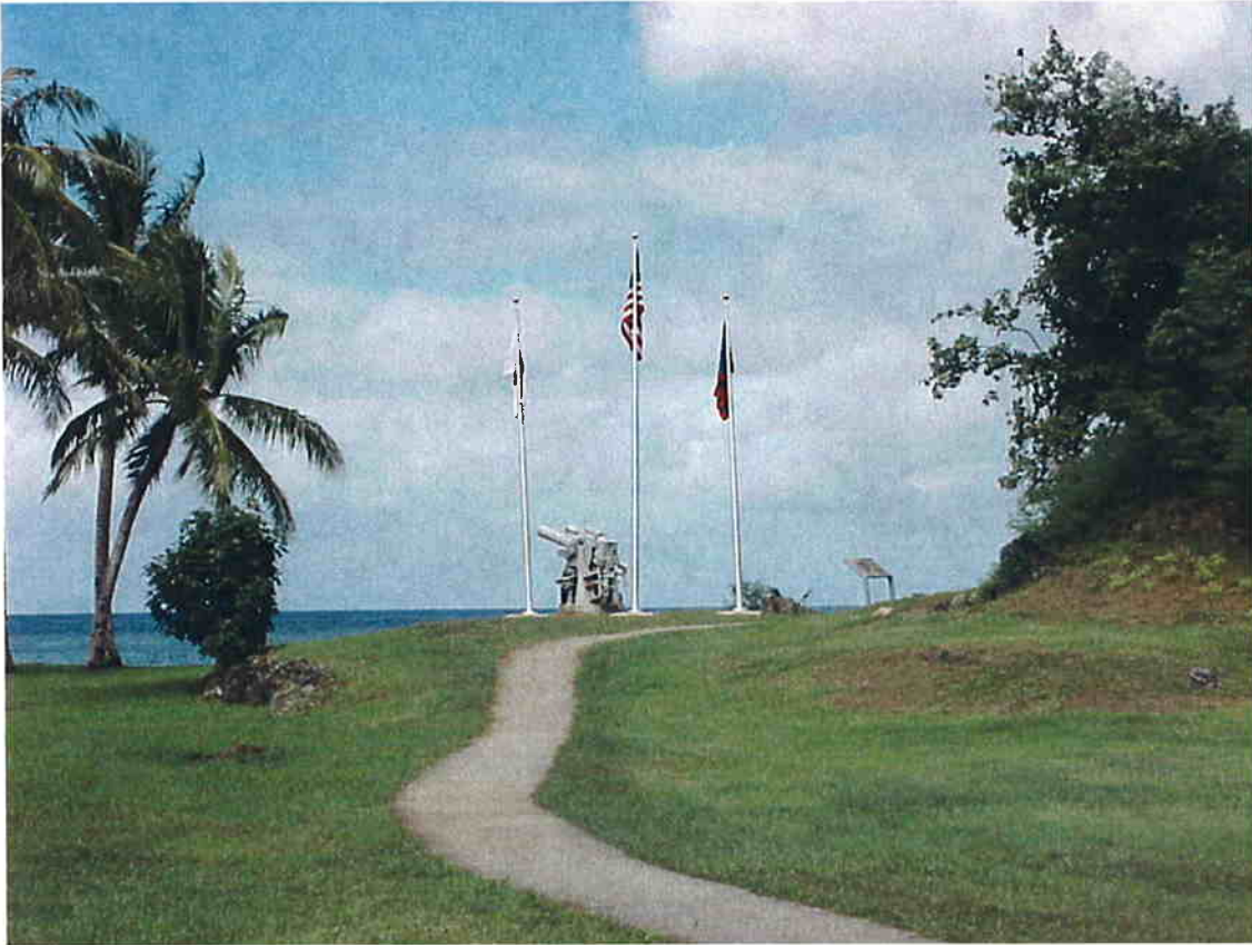
Plate 19 Agat Beach memorial area.