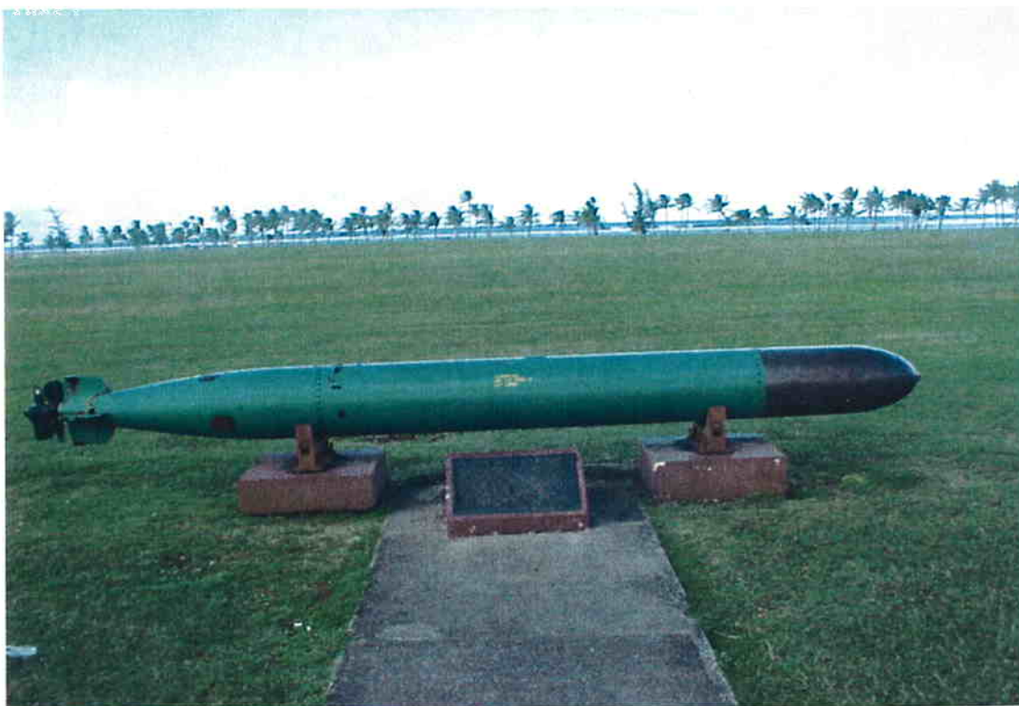
Plate 2 A view towards the Asan Beach landing area. The offshore reef area is also part of the park. The beach is 15 to 20 feet wide and the reef beyond is approximately 1000-foot wide, paralleling the entire shoreline