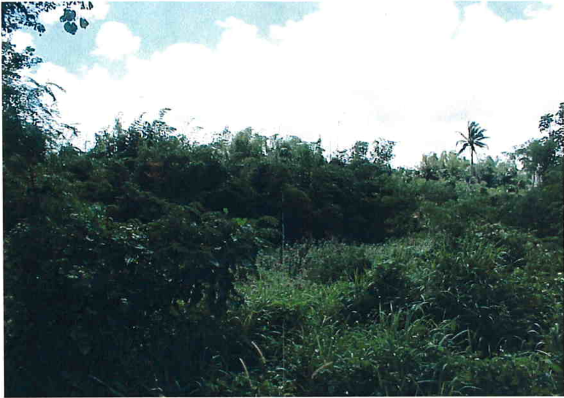
Plate 9 An area of Fonte Plateau where sawgrass, tangantangan and other grasses, small shrubs, and trees mix to make an almost impenetrable forest landscape.