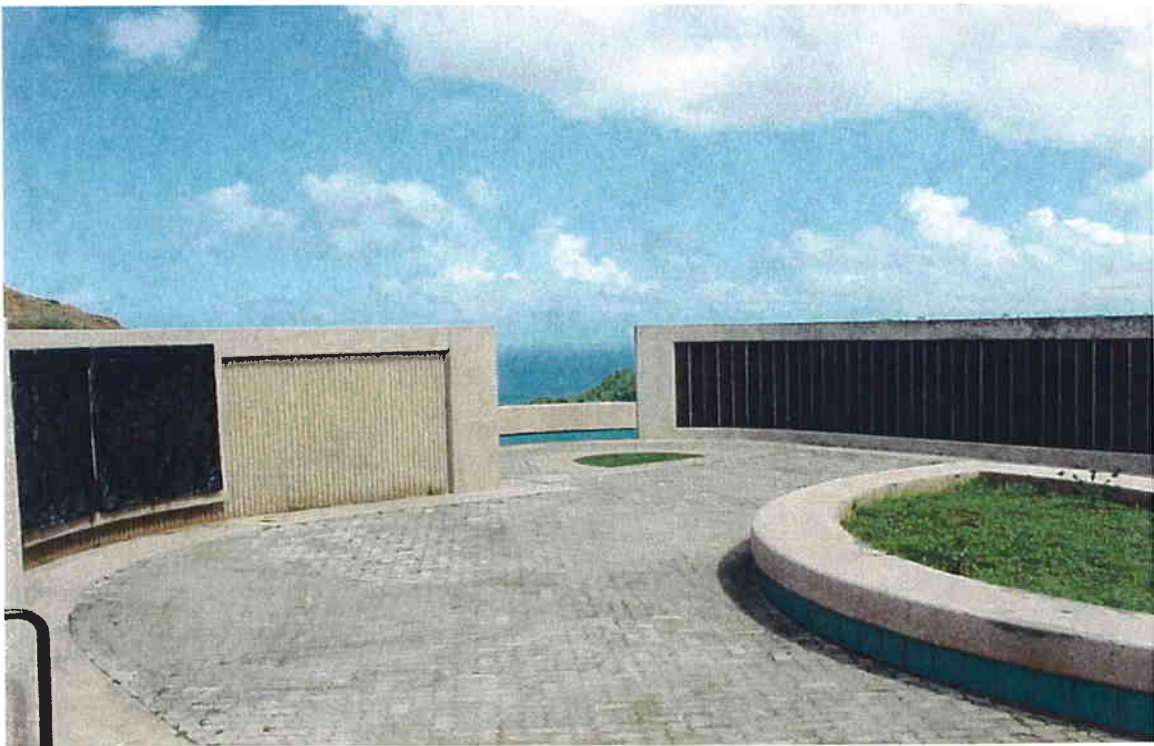
Plate 6 Part of the memorial complex at the Asan Bay Overlook. The memorial area includes a section honoring those who fought in the battle and a memorial to the Guamanians who died during the occupation. The tablets along these walls include the names of those who died during the conflagration.