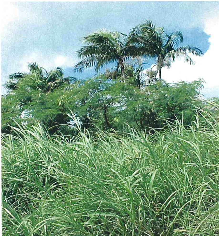
Plate 10 Sawgrass, tangantangan and coconut palm. The sawgrass is in excess of 6' high