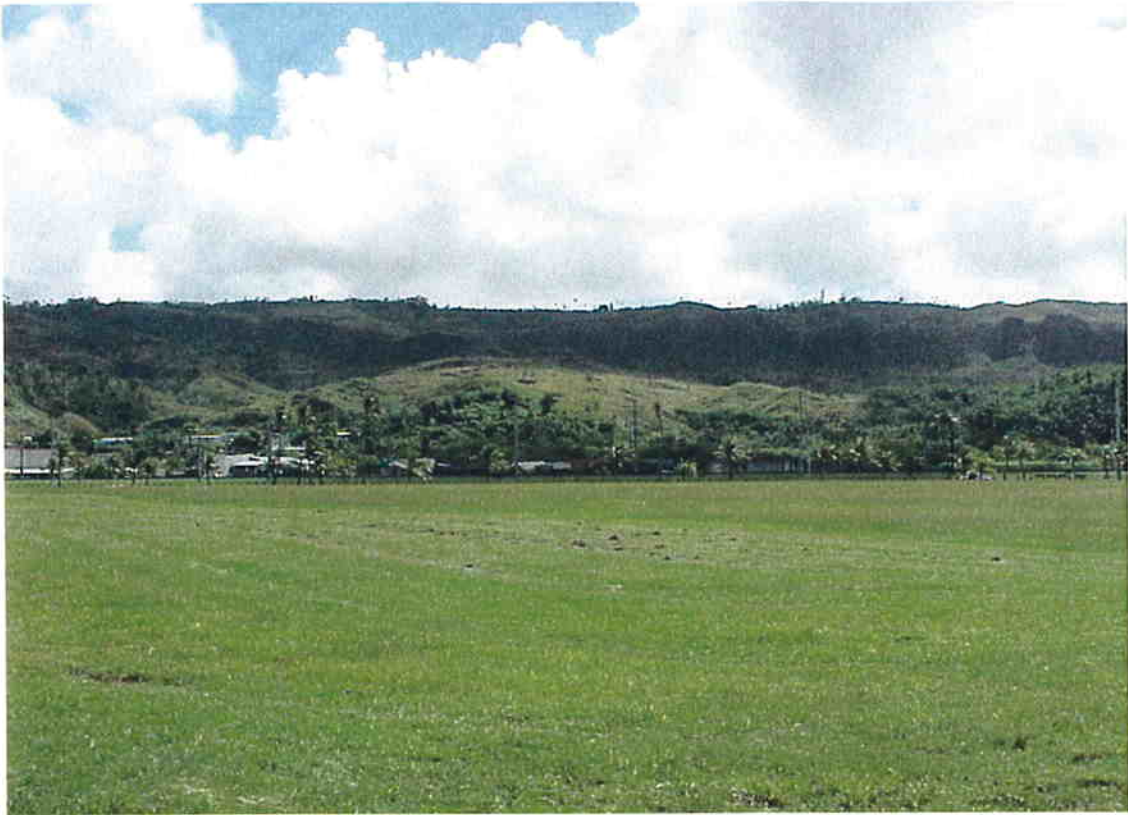
Plate 3 View from Asan landing beach toward the heights above. The landing was made under defensive fire from the ridge above. The invasion force had to move across the open land and scale the heights.