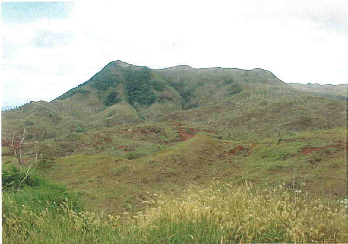
Plate 20 After establishing a beachhead, troops that landed at Agat troops had to move inland towards the high ground of Mt. Tenjo and Mt. Alifan, Note the badlands on the lower slopes of the mountain. Much of this badland development is directly attributed to recurring fires across the savanna.