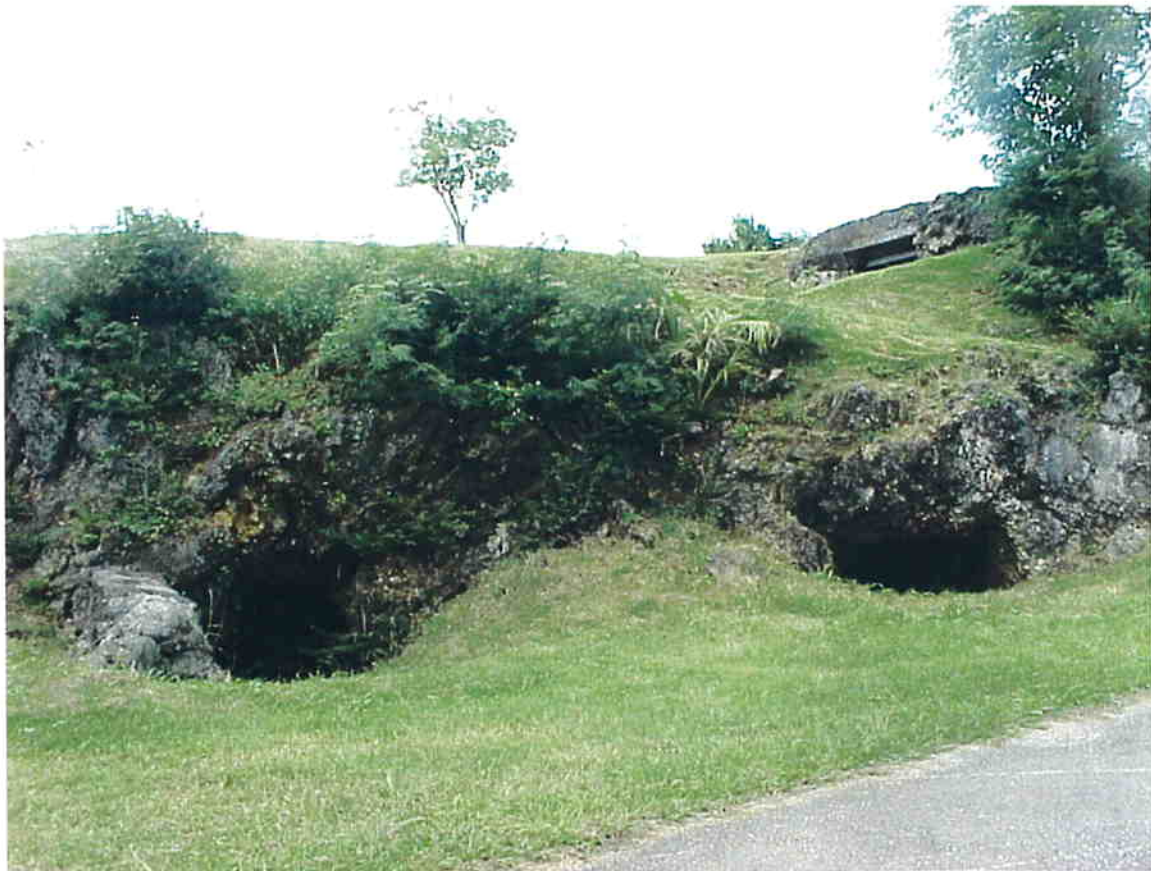
Plate 18 The caves in the foreground and the pillbox above are just a few of the Japanese defensive positions at Agat beach.