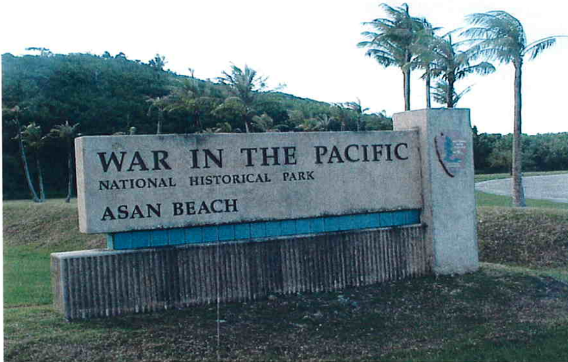
Plate 1 Asan Beach Unit is located just off Marine Drive between Adelup Point and Asan Point, approximately 2 miles from central Agana.