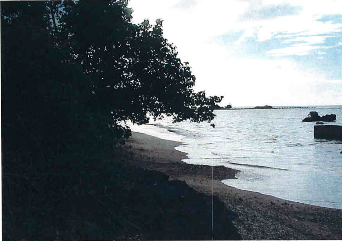
Plate 17 Agat landing Beach. This narrow coastal strip is where the American southern landings occurred. This park unit includes 557 acres water.