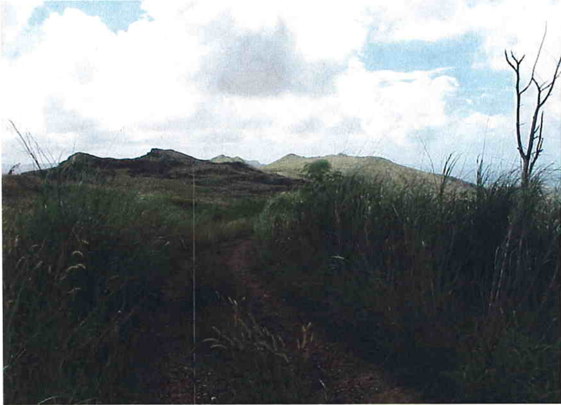
Plate 13 A view across Mount Chachao towards Mount Tenjo. Note the height and mass of the swordgrass.