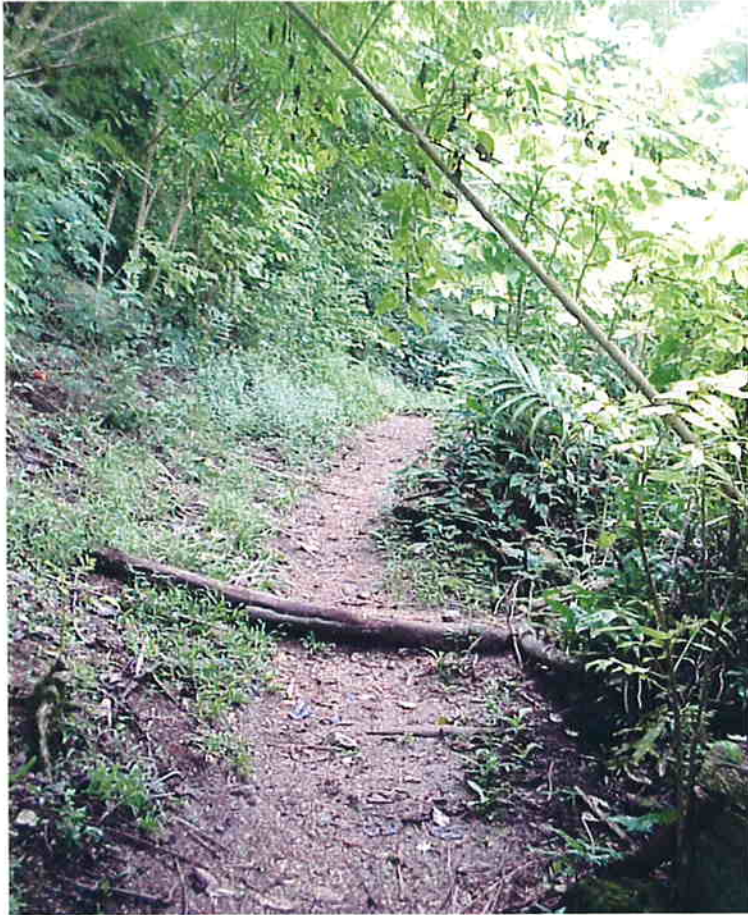
Plate 11 The trail to the Piti Guns winds through a mahogany forest