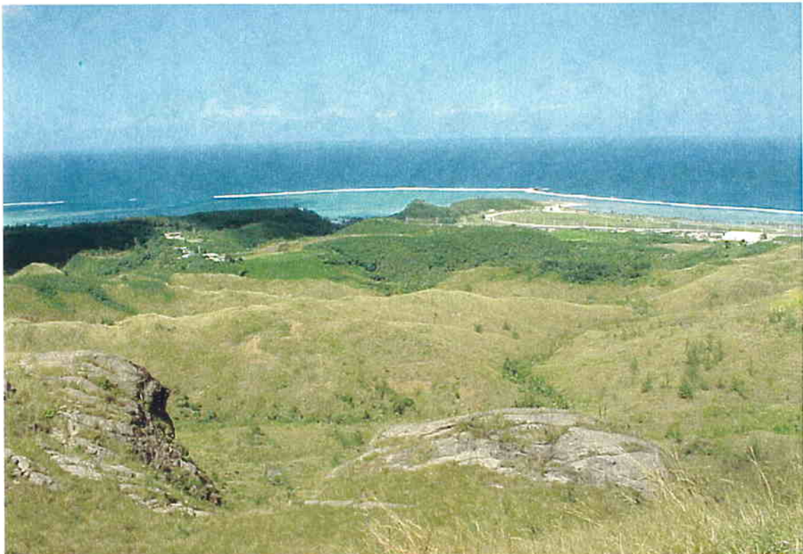
Plate 4. View from the heights (Asan Inland Unit) above the landing beach. Grass area along beach in upper right corner is the area where Plate 3 was taken. Towards the beach is jungle, the hills in the foreground are covered with sawgrass. This view is typical of the 1944 setting that the NPS wishes to preserve.