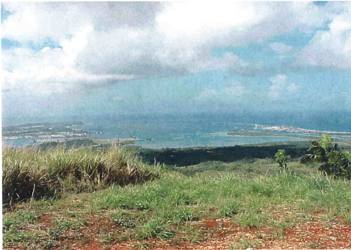
Plate 15 From defensive positions on the high ground in the Mt. Chachao Mt. Tenjo area Japanese defenders had an excellent view of not only the landing beaches, but also Apra harbor and the Orote Peninsula as shown above. Note the scrub area in the foreground. This is what the ground cover becomes after successive fires.