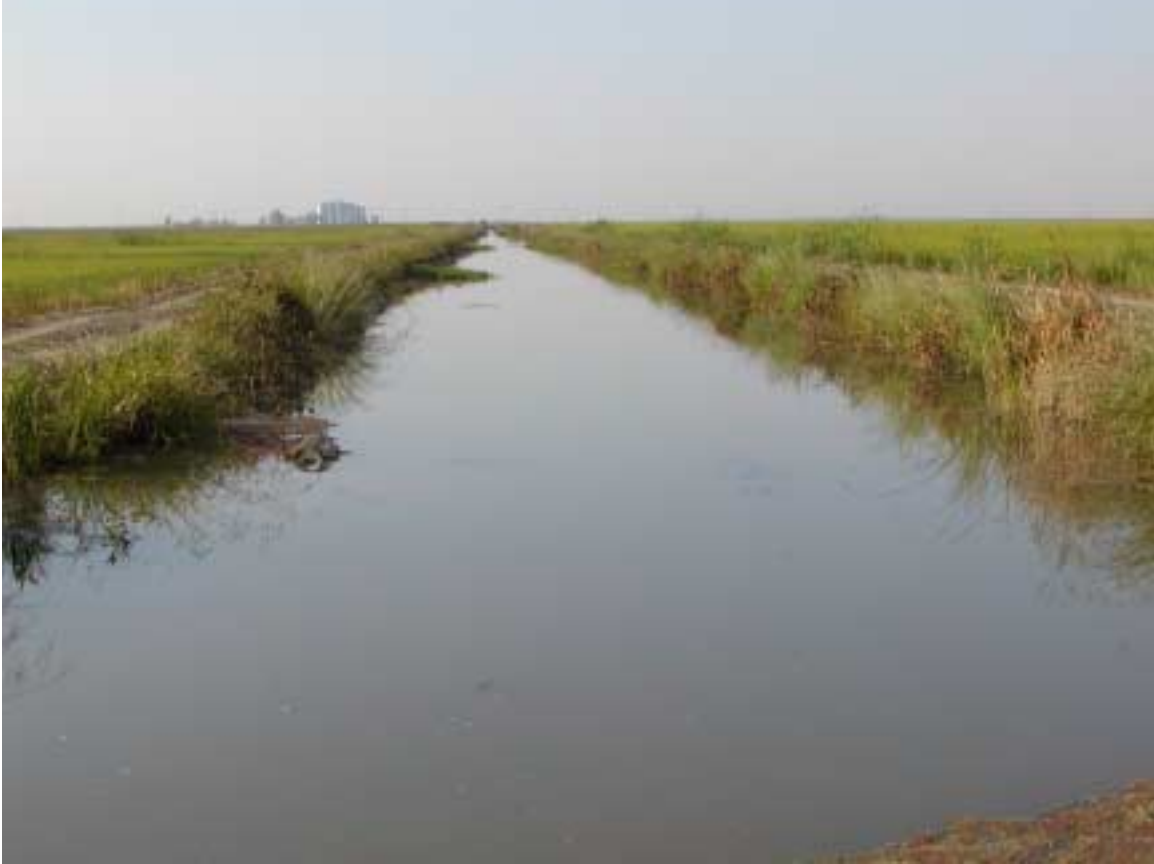
Ditch on Sills Ranch property.