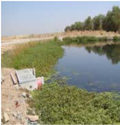
Pond at east side of BKS