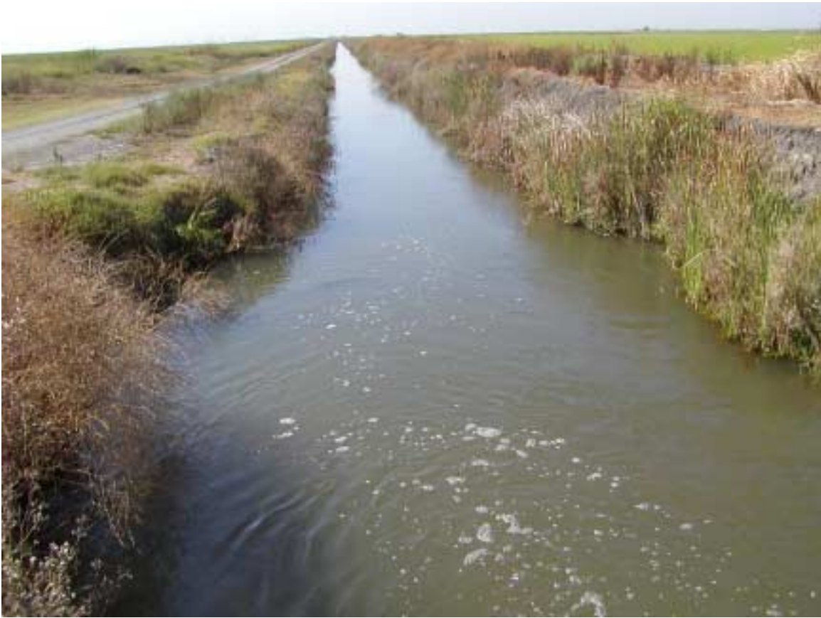
Ditch commonly referred to as Snake Alley.