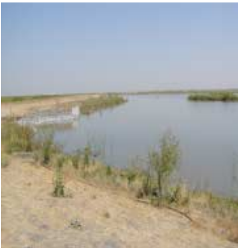
Marsh S-W side of BKS