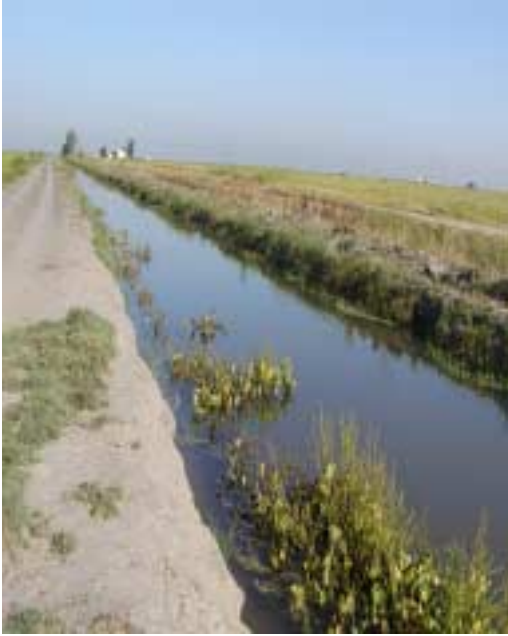
Ditch on east side of Ayala property