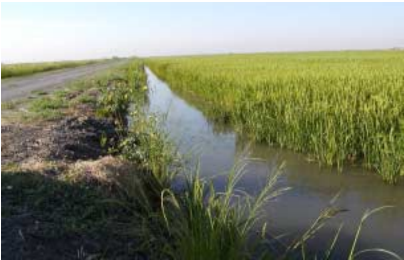
Edge of rice located at west side of Ayala property