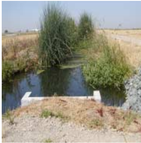
BKS E-W canal adjacent to pond