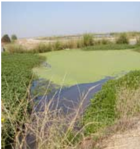
Pond at west end of BKSE-W canal