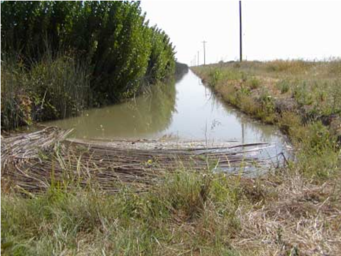
Ditch located on Airport property, adjoining Miester Road.