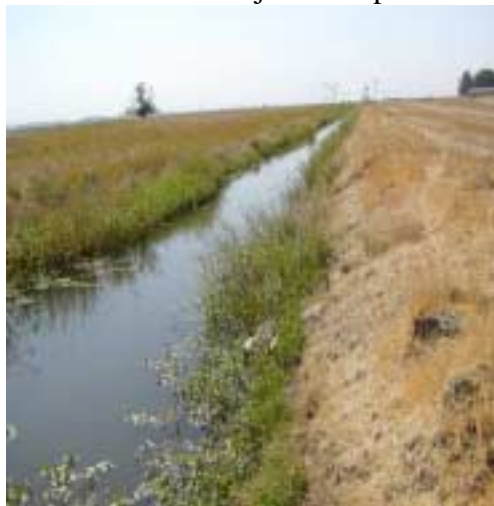
Canal middle of BKS property near house