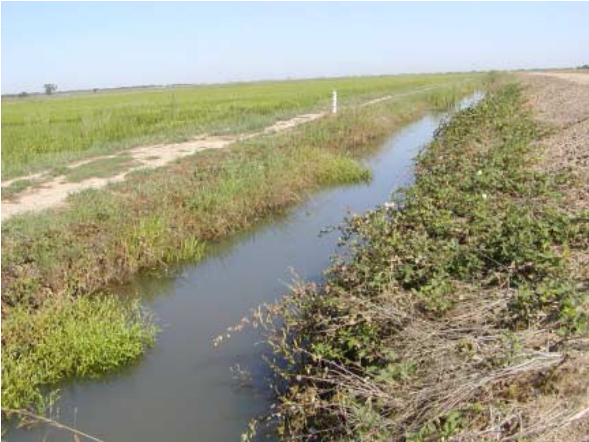
Ditch on Bennett South property.