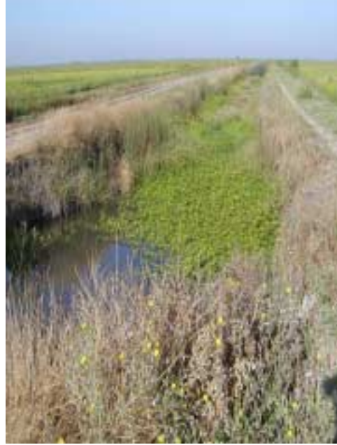
Ditch at south end of property