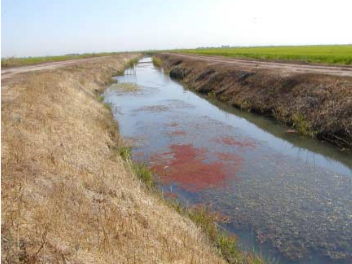
Ditch on Lucich North property