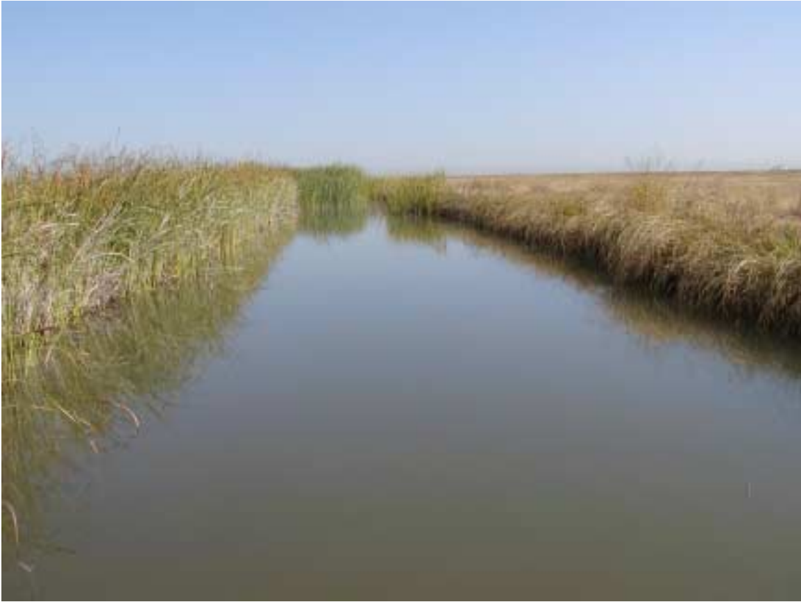
Ditch off of Elkhorn Road.