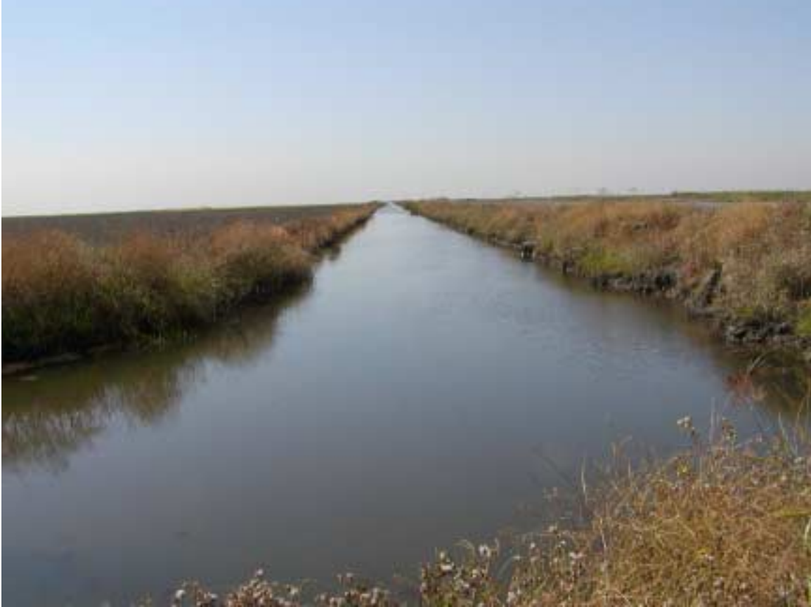
Ditch on Lucich South property.