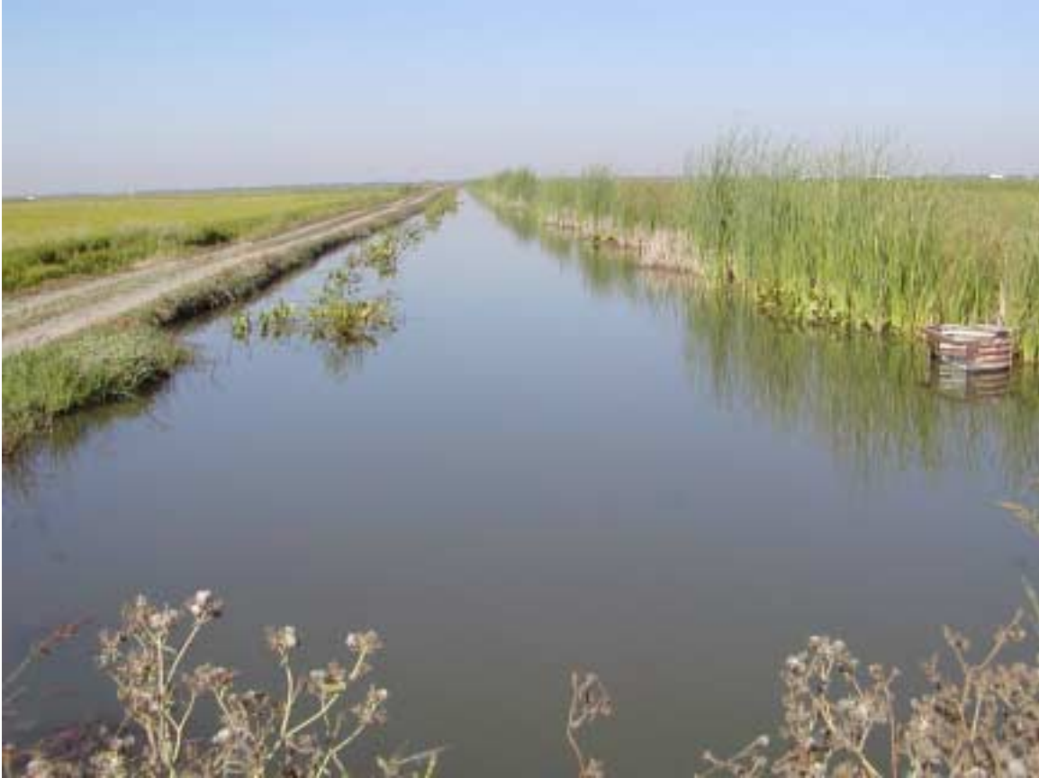
Ditch on NTI property near I-99 and an airstrip.