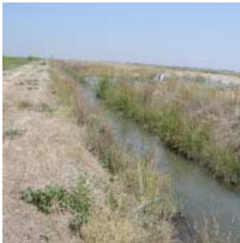
Ditch at west edge of BKS property