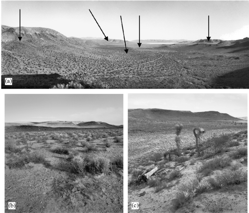
Fig. 2. (a). Panoramic overview of Goldstone study plots, arrows from left to right: G-1, G-2, G-5, G-3, and G-4. Goldstone Lake (dry) is in the distance. (b,c) Study plots G-7 and G-9, respectively, at Goldstone, where tortoise densities were estimated at \sim 21 tortoises \text{km}^{-2} in the 1980s (Krzyśik, 1997).