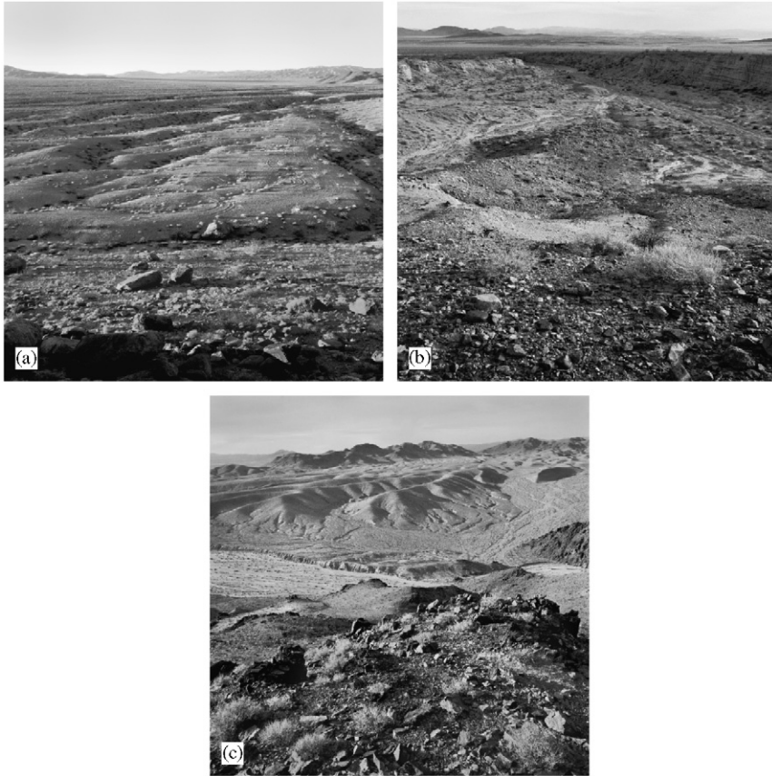
Fig. 4. (a) The Eastgate 1 study plot is in a military training area. (b) The Eastgate 2 study plot is in a military training area. (c) The Soda Mountains study plot is in a remote, undisturbed area.