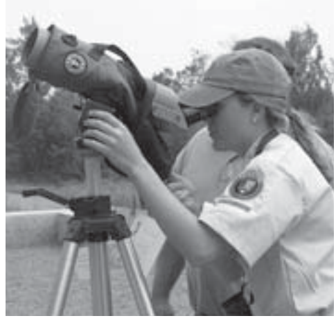
Friends of Acadia provides support for programs like Peregrine Watch

Friends of Acadia is a private, nonprofit organization dedicated to ensuring the long-term protection of the natural and cultural resources of Acadia National Park and its region. To meet this mission, Friends of Acadia channels private donations to conservation and historic preservation projects in the park, monitors planning and legislative activities affecting Acadia, and sponsors volunteer groups in Acadia.