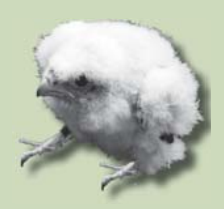
Peregrine chick.

Please be aware that the Precipice Wall, Valley Cove Wall, and Beech Cliffs areas are closed until the peregrine chicks mature and leave the nest (usually in late summer). Other areas may be closed; check with rangers for details. Also, see Park Closures (page 2) for specific trail and other closures during your visit.