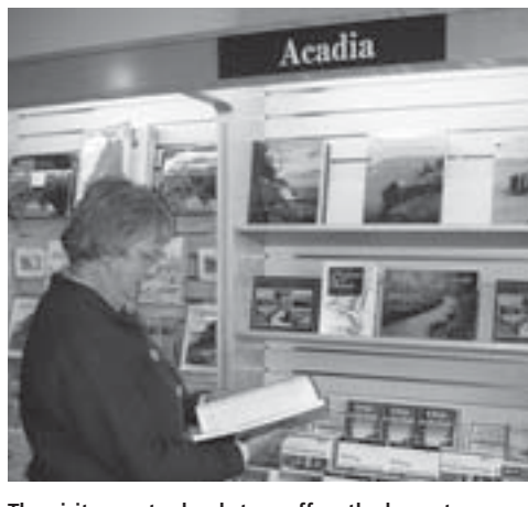
The visitor center bookstore offers the largest collection of sales items in the park.

Looking for a guide to plants? Trying to find something to keep your kids occupied on a rainy day? Eastern National bookstores carry a wide variety of educational items, including books, maps, videos, notecards, and more. Bookstores are located at Hulls Cove Visitor Center, Sieur de Monts Nature Center, Park Headquarters Information Center, Blackwoods and Seawall Campgrounds, and the Islesford Historical Museum.