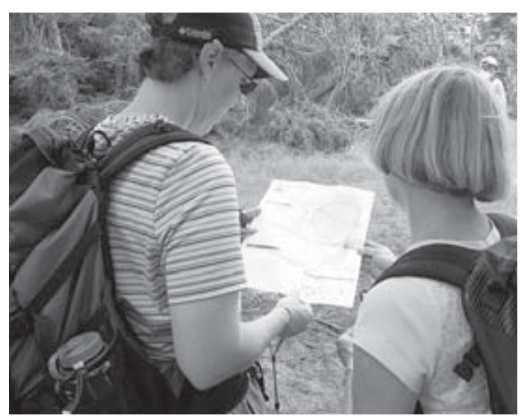
Always carry a map on longer hikes.

Ocean temperatures at Sand Beach rarely rise above 55° F (13° C). For warmer water, try Echo Lake on Route 102. Many other ponds and lakes on the island are public water supplies where swimming, wading, and pets are prohibited. Please respect posted regulations.