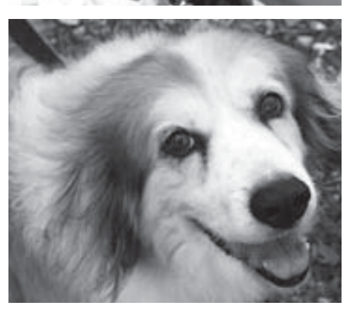
Protect wildlife: Don't feed wild animals, use binoculars for close-up views of wildlife, and keep your dog on a six-foot or shorter leash at all times.