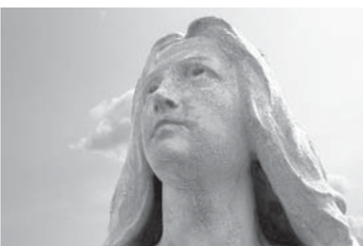
(Top) Visitors enjoy the interpretive trail at Saint Croix International Historic Site. (Bottom) Evangeline is a heroine of the French Acadians.

The National Park Service supports the Maine Acadian Heritage Council, a non-profit organization composed of historical societies, cultural clubs, towns, and museums working together to preserve Maine Acadian culture. These organizations operate a number of different cultural attractions, which are open to visitors from mid-June to early September. At these sites you can explore Maine Acadian Culture for yourself. The St. John Valley is approximately five hours north of Bar Harbor along the St. John River, which forms the northern border between Maine and New Brunswick. www.nps.gov/maac