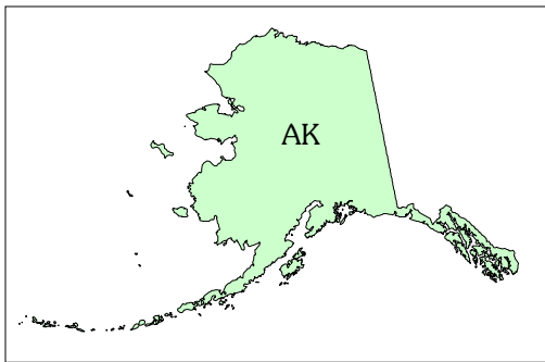
Figure 2. Numeric Change in Resident Population for the 50 States, the District of Columbia, and Puerto Rico: 1990 to 2000