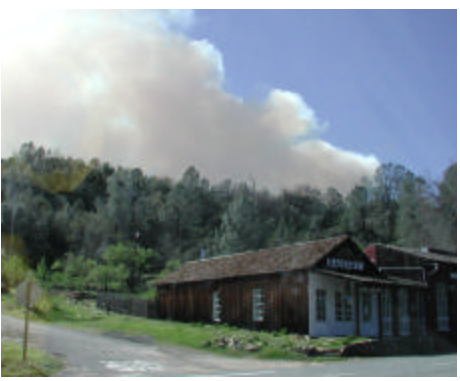
Smoke column behind historic buildings in Old Shasta.