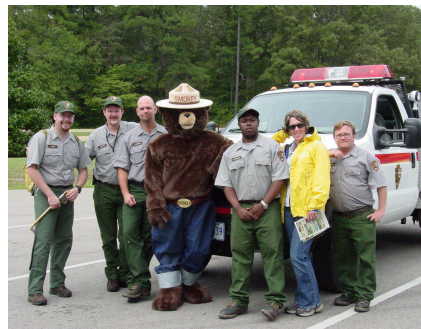
Smokey and the Fire Crew