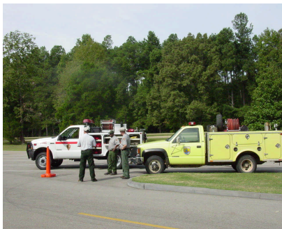
NPS and USF&WS Engines