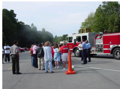
Tupelo Fire Department Engine 4