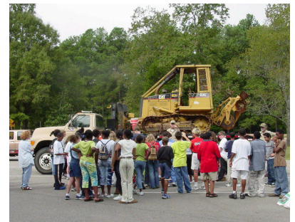
Mississippi Forestry Commission Tractor Plow