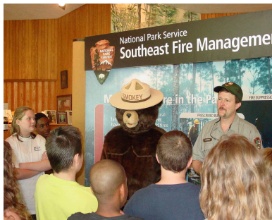
Southeast Region Fire Management Display

The Natchez Trace Parkway fire management office kicked off Fire Prevention Week at the Tupelo Visitors Center on October 3. Assisting Natchez Trace fire staff were members of the Tupelo Fire Department, the Mississippi Forestry Commission, the US Fish and Wildlife Service Noxubee National Wildlife Refuge, and Smokey Bear. A total of 130 children from local schools attended the event, as did 78 visitors. Each agency showed their fire equipment and presented both structural and wildland fire prevention information.