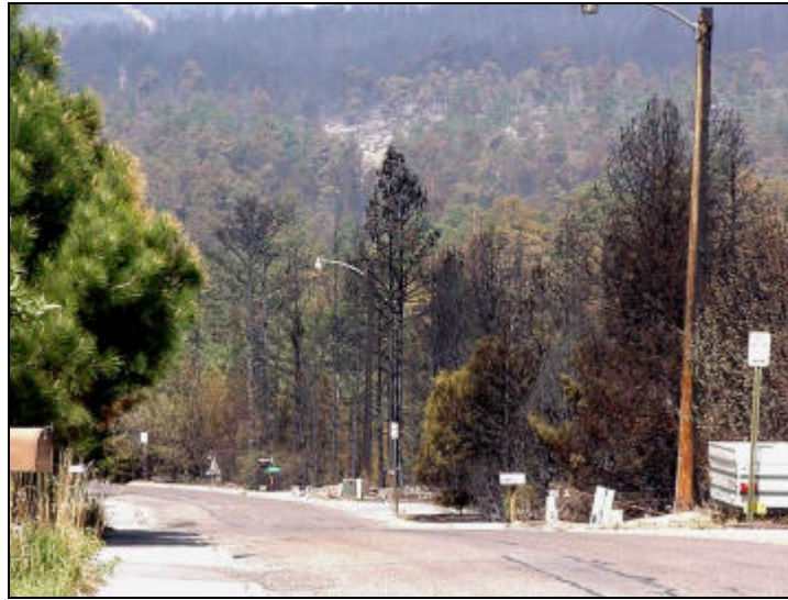
Photo 10—This is a portion of the area within the yellow rectangle shown in the previous photo. The trees burned from the burning homes. The homes ignited from the low intensity surface fire and adjacent burning homes.