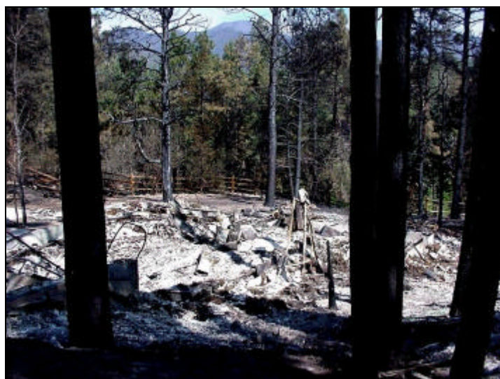
Photo 4—The unconsumed, moderately scorched tree canopy along with the remaining wood rail fence indicate that this home was exposed to a low intensity surface fire. The high intensity wildfire burned on the hills in the background.

the 4-plexes on the northwest side ( Photo 6 ), occurred from structure-to-structure spread (communication with Steve Coburn, LAFD). In general, the intense wildfire burned past the residential area to the west and north of Los Alamos. Scattered islands of destroyed homes at the community margin suggest low firebrand exposures and low spotting potential during the late night and morning hours during which much of the residential area burned.