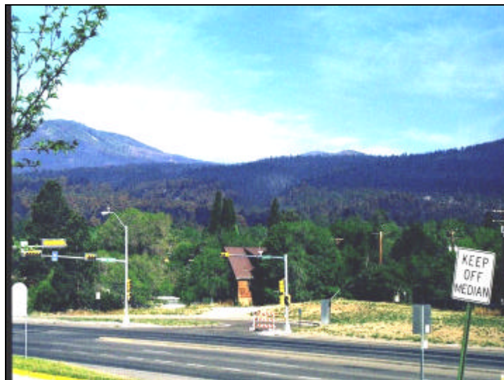
Photo 1—The crown fire burned on the ridge (mid-picture) west of Los Alamos.

1) Although the Cerro Grande Fire burned as an intense, continuously spreading crown fire (fire spread through the tree canopy) in certain areas, within several hundred yards or more of the Los Alamos residential area it burned as a surface fire—an under burn. The pictures show tree canopies that were variably scorched but not consumed next to totally destroyed homes.