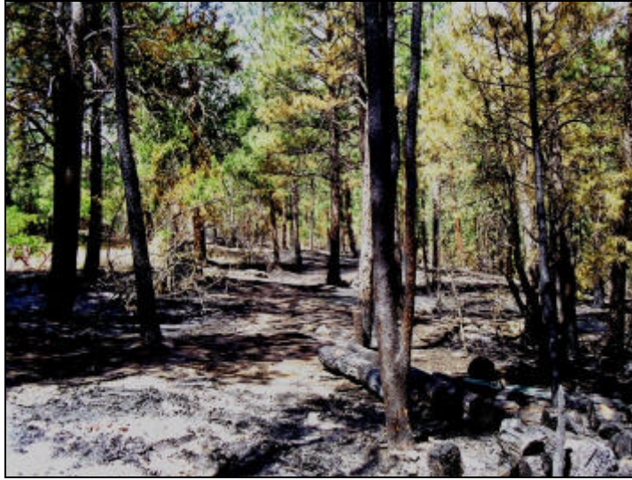
Photo 2—The fire burned only in surface fuels as it came from the wild land in the background toward the residential area. The wild land fire commonly burned through continuous fuels to encounter and burn through heavier residential fuels such as woodpiles (bottom right), flammable shrubs, heavy pine needle beds, and homes.