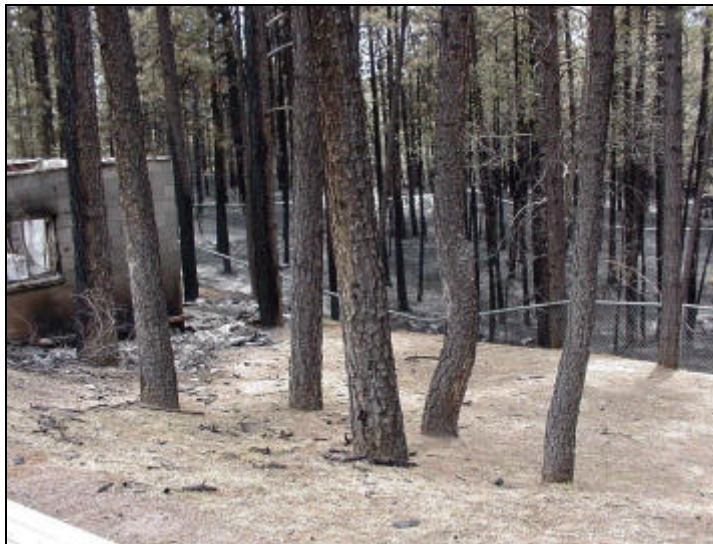
Photo 3—Within the residential area, separated by several streets from the wild land, the fire generally burned as an under-burn with scorched but unconsumed tree canopies. The surface under the trees in the foreground did not burn, but the house to the left was totally destroyed.

2) Commonly homes were totally destroyed with the tree canopies leading up to and adjacent to the structures remaining unconsumed. The canopy consumption that occurred adjacent to and downwind from homes occurred from burning homes. With the exception of two local and limited areas where crown fire occurred adjacent to the residential area, a surface fire spread into Los Alamos. The unconsumed vegetation surrounding destroyed homes indicates that these homes were exposed to a low intensity surface fire, not a high intensity crown fire. Many of the homes destroyed, particularly