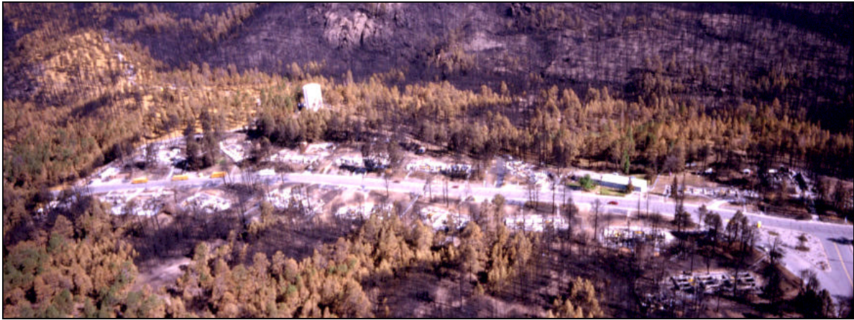
Photo 6—Significant structure-to-structure fire spread occurred from flames and firebrands in an area of multifamily residences. The unconsumed vegetation surrounding the corridor of destruction indicates that the high fire intensities were due to the burning structures.

3) My examination suggests that the abundance and ubiquity of pine needles, dead leaves, cured vegetation, flammable shrubs, wood piles, etc. adjacent to, touching and or covering the homes principally contributed to the residential losses. Discussion with the Los Alamos FD indicated that few wood roofs existed and thus were not a significant factor. In many areas of home destruction a continuous ponderosa pine ( Pinus ponderosa ) canopy existed within the residential area. This produced a continuous pine needle fuel bed to the homes as well as pine needles deposited on the homes (roofs and gutters). An examination of surviving homes in areas of home destruction indicated that a low intensity surface fire in pine needles could burn to a home and ignite its wood siding. In several cases, a scratch line that removed pine needles from the base of a wood wall kept the house from igniting. Firebrand ignitions likely started fires in these pine needle fuels in areas within the community that were separated by streets.