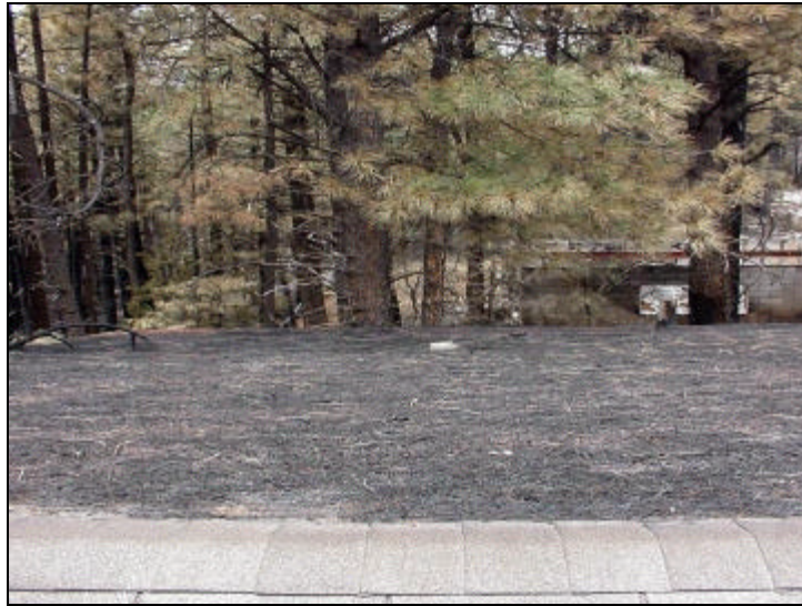
Photo 8—The surrounding ponderosa pine canopy deposited pine needles on this roof. The roof surface fire burned the needles without igniting the roof. The roof covering types were “built-up” gravel and composition shingle. The house did not have gutters to accumulate needles, potentially ignite and thereby ignite the eave edge. Although the neighboring home was totally destroyed (in the background) the tree canopies did not burn. The roof pine needle fire likely ignited from firebrands generated by the burning home next door.