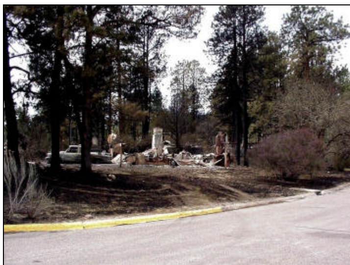
Photo 5—This totally destroyed home was within the residential area. A road separated it from other burning vegetation and homes. The unconsumed vegetation with little scorch indicates that the fire intensity surrounding the home was low. This suggests that firebrands (burning embers from other fires) ignited the home directly and/or in adjacent flammable materials that spread to the home.