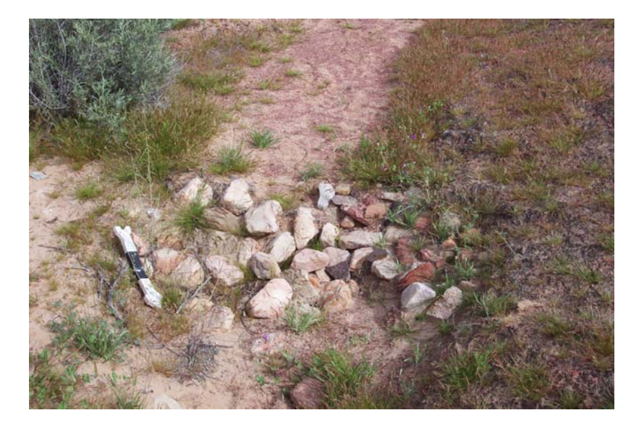
Photo noting approximately 30cm of sediment deposited behind the check.

Close up and overview of gully with checkdams.