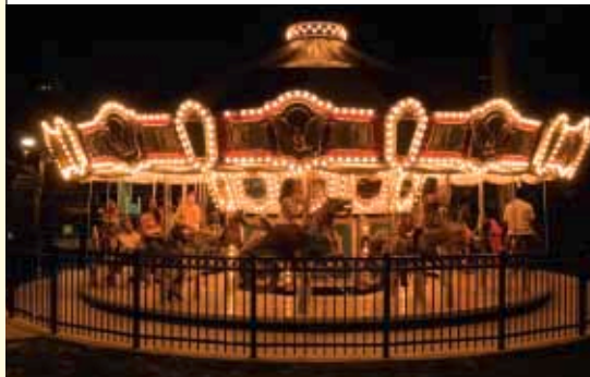
Philadelphia Park Liberty Carousel

You are standing in America's most historic square mile, so you'd better get started! Head to the Independence Visitor Center for your first stop. Timed tickets are available for Independence Hall , along with all the information you need to see the Liberty Bell , or the current archaeology and preparations for the President's House .