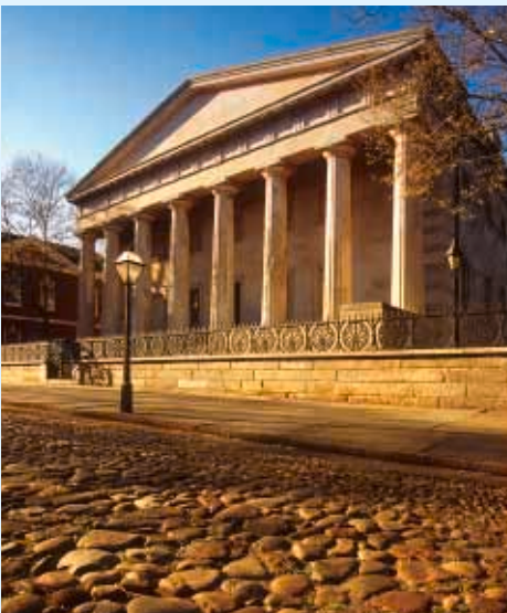
The Second Bank of the U.S.