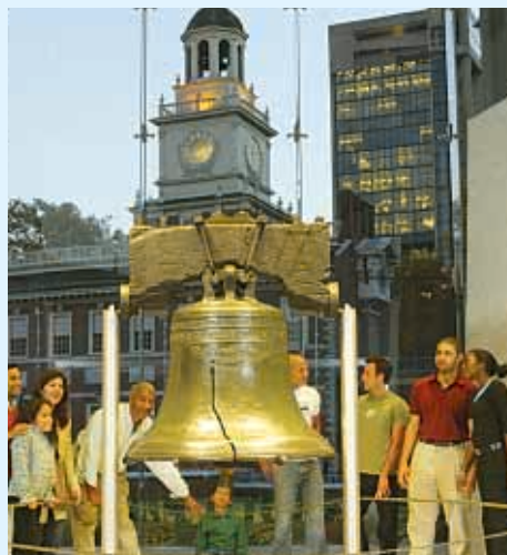
The Liberty Bell Center

The Liberty Bell Center 6th Street between Market & Chestnut Streets View the Liberty Bell and exhibits which trace the Bell's role from working bell to symbol for those seeking their freedom. The President's House Site Commemoration is being built at the entrance to the Liberty Bell at 6th and Market Streets. Daily 9:00 a.m.-5:00 p.m.