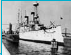
USS Becuna (left) USS Olympia (right)