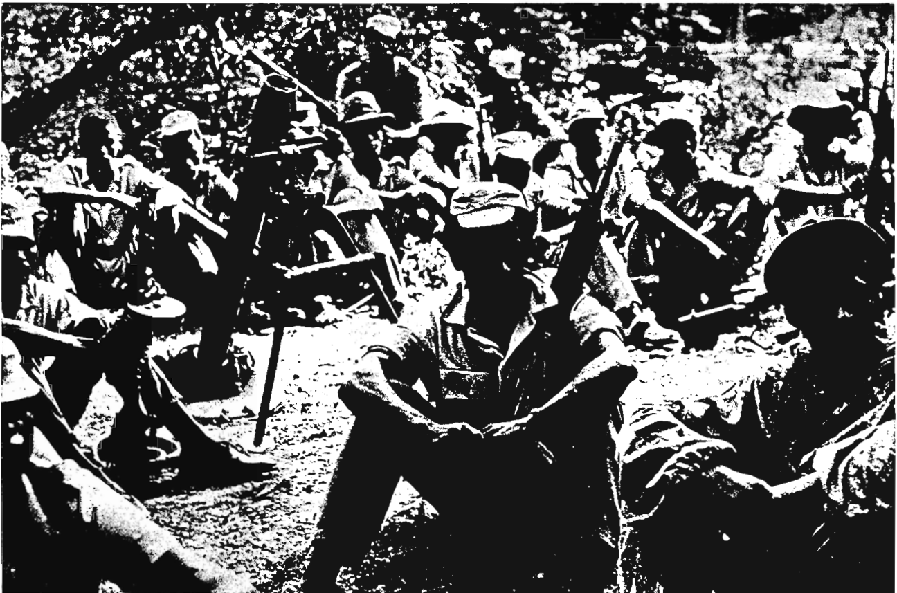
Guerrillas in Portuguese Guinea with Chinese-made Arms

Vice Premier Hsieh Fu-chih 26 April 1969