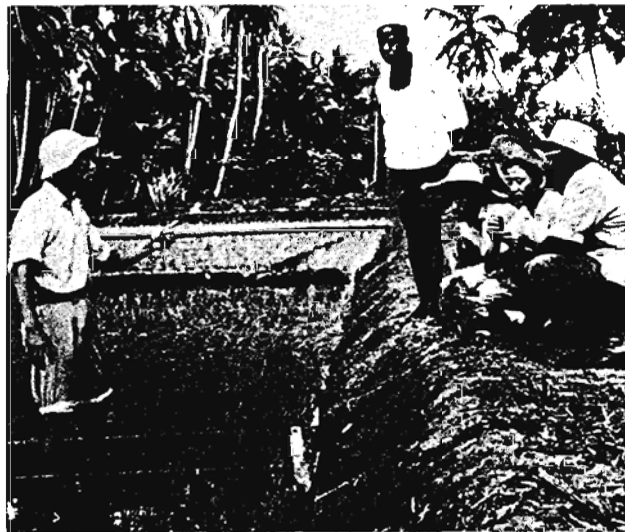
Chinese Agricultural Specialist in Tanzania