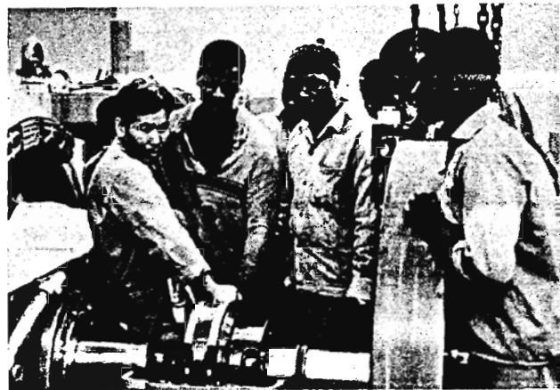
Chinese Technician in Guinea

The aid programs in Congo (Brazzaville) and Mauritania are smaller, but the Chinese nevertheless continue to demonstrate an active interest in both states. Elsewhere in Africa, however, significant Chinese presence and influence are almost