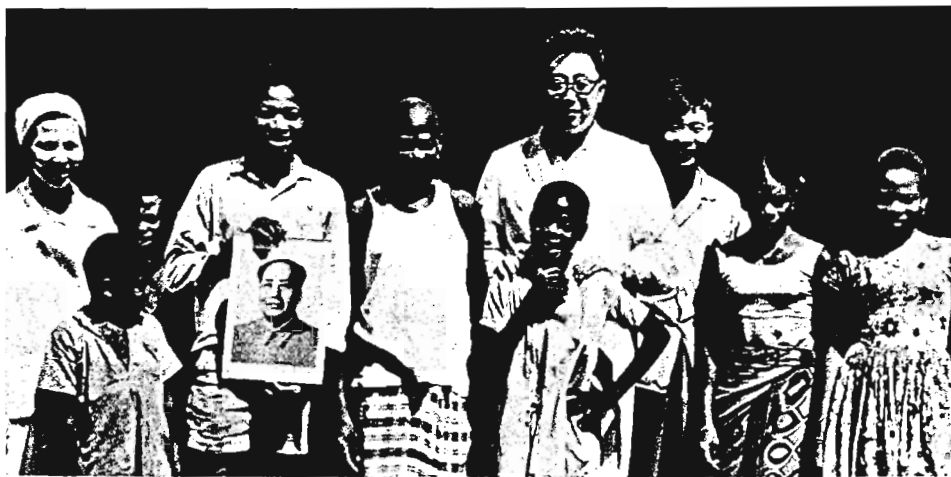
Chinese Doctor And Medical Personnel In Tanzania

Peking appears to view Zambia as one of its brightest prospects for future expansion. Although the Chinese had never before extended aid to the Lusaka government, in 1967 they gave it a $16.8 million interest free loan for the construction of a road from Lusaka to western Zambia. Soon after, they agreed to build the TanZam railroad which will give the Zambians an outlet for their copper through friendly Tanzania rather than Rhodesia. By supplying technicians and workers for their projects, the Chinese have been