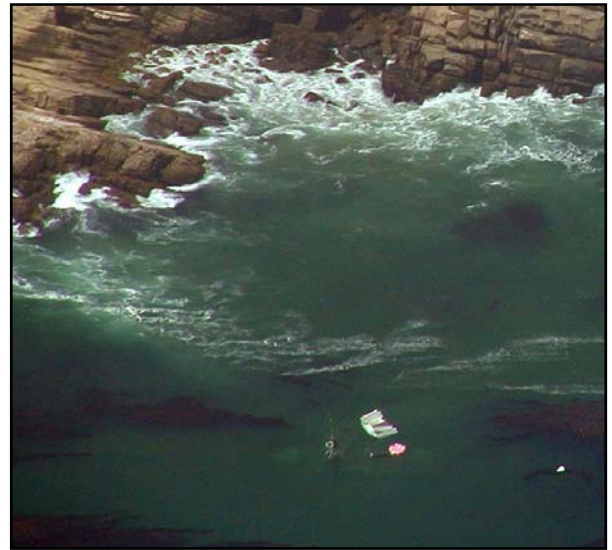
Debris from the vessel in the surf