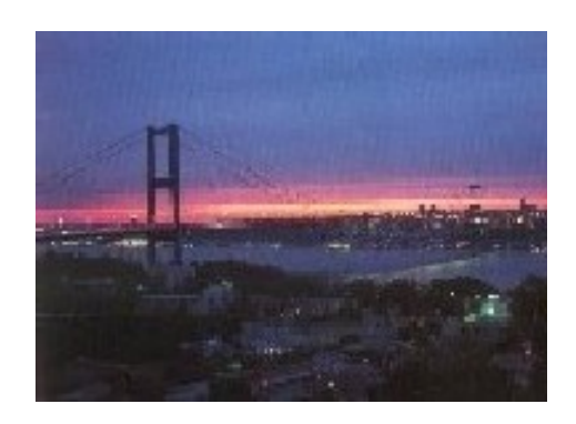
Istanbul by night