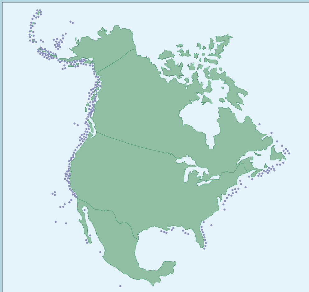
Figure 21.2 Deep, Cold-water Coral Reefs Found Throughout U.S. Waters

● Known deep, cold-water reefs (reef area not to scale)