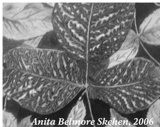
Anita Belmore Skehen, 2006

U.S. Life-Saving Stations, and other maritime activities. Because the National Lakeshore offers so many varied cultural and natural resources, it is an ideal location for creative endeavor. The beauty and serenity of the land and water are inspiring.