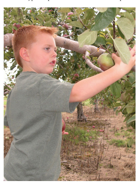
More than one way in. Through pathways both expected and surprising, children of farmworkers have higher pesticide exposure than the general population.

The UC Berkeley center's projects also include a randomized intervention study to see what types of preventive measures best