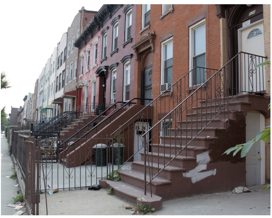
Home is where the exposure is. A myriad of exposures in low-income urban housing—including vehicle exhaust and pesticides used in homes—contribute to conditions ranging from cancer to low birth weight.

In 2000, however, the EPA announced that chlorpyrifos and diazinon would both be banned as household pesticides, and "the levels of pesticides in air during pregnancy