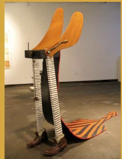
Chela Fielding, Gigolo , 2008 resident