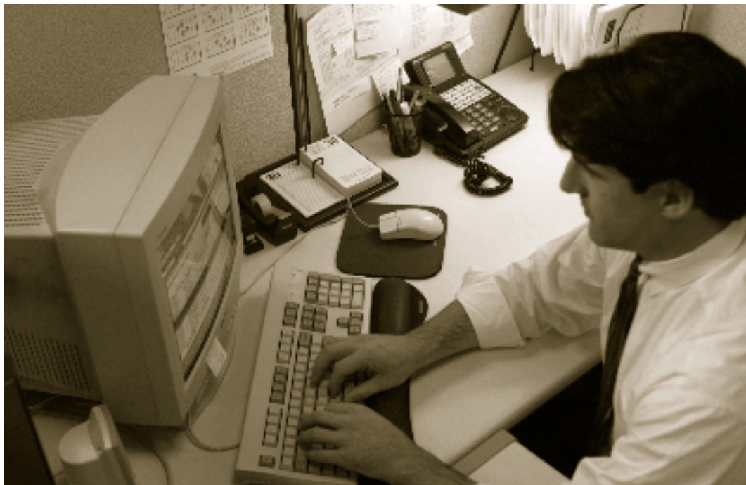
Continuing education and on-the-job training help workers to keep current in their field.

In the life sciences, employers increasingly prefer to hire scientists who have a Ph.D. and have completed a period of academic research, known as a "postdoc," immediately after obtaining a degree. Postdocs may last several years, during which researchers receive low salaries and may have little independence. But for many, the opportunity to be on the cutting edge of science and technology is worth the extra work.