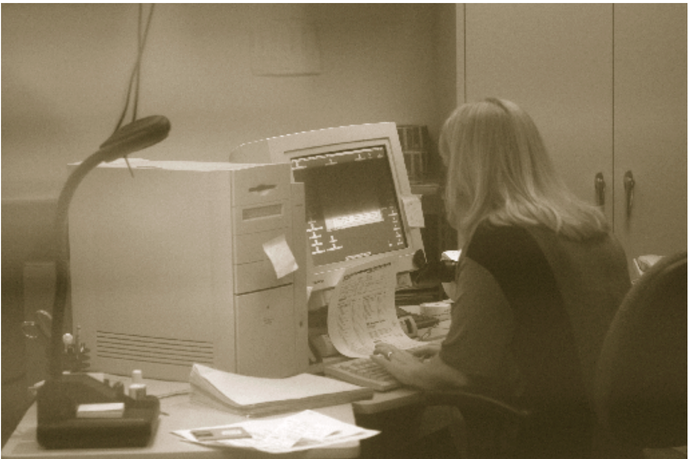
In this industry, as in many, the tasks and hours at which workers must perform depend on the requirements of specific projects.

Not surprisingly, most people who do research and development are in the professional and related occupa-