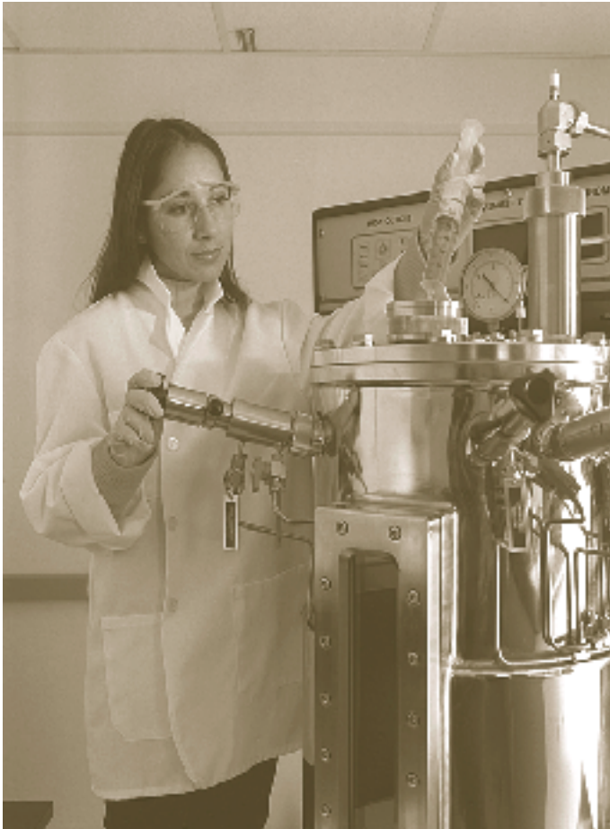
Workers who handle potentially dangerous materials must follow safety procedures.

Automotive. Automotive research and development leads to new vehicles and systems that are more efficient, powerful, and reliable. Significant automotive research and development is directed toward integrating new technologies into complete vehicles. But there is also much research on improving individual components, such as light emitting diode (LED) headlights and fuel injectors.