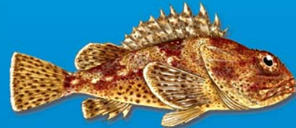
California scorpionfish, sculpin