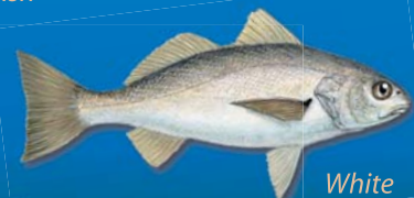
White croaker, kingfish, tomcod