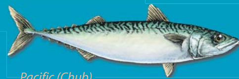
Pacific (Chub) mackerel