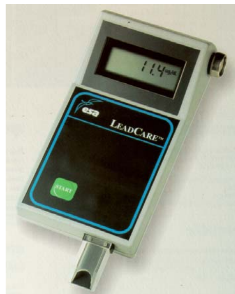
ESA's LeadCare ASV instrument

A second objective of this project is to collect samples from earlobe capillaries and determine whether these samples can be used to monitor blood lead levels. This sampling and analytical technique is less invasive and could provide quicker results than current methods, guiding efforts to reduce lead exposures rapidly.