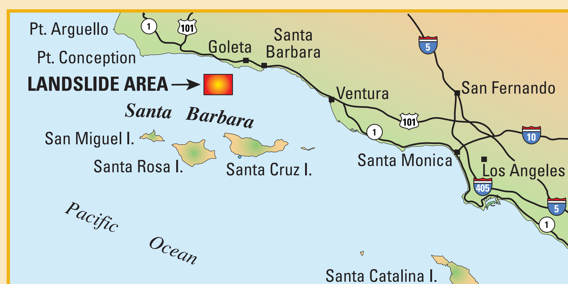
Location of Santa Barbara Channel