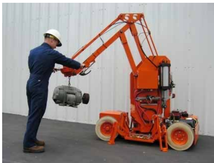
Figure 1.—Manipulator in operation.

To operate, a worker trams the unit into position for the lifting task and deploys stab-jacks for leveling and stabilizing. The linkage system is designed to allow the operator to guide heavy loads precisely; for example, sliding a 200-pound gear assembly onto a shaft where alignment and damage to equipment are critical considerations. Although the operator needs only 10 pounds of pressure to lift the load, the momentum of moving the load can create a need for braking, and so the operator has hand brakes to stop arm and turret movement immediately. The ease of tramping and steering, along with the small size of the manipulator, allows operators to stow the unit conveniently close by without interfering with ongoing operations.