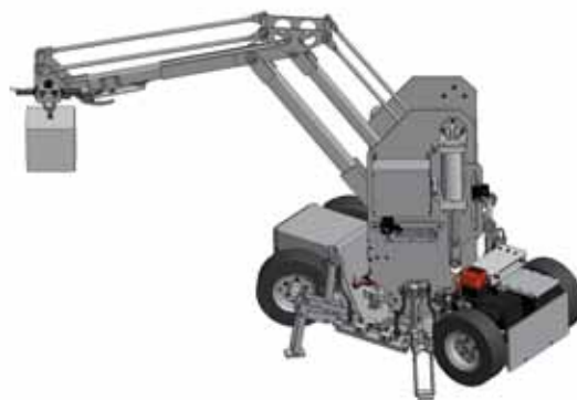
Figure 2.—Manipulator shown loaded with stabilizers activated.