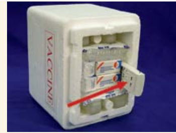
Place a thermometer next to the vaccine but not in contact with the refrigerated/frozen packs.