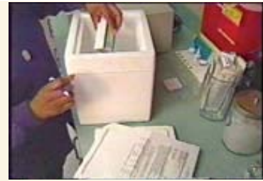
Crosscheck the contents with the packing slip to be sure they match.