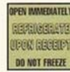
Attach appropriate labels to the outside of the container.