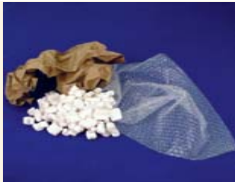
Place bubble wrap, crumpled brown packing paper, or Styrofoam™ peanuts between the refrigerated/frozen packs and the vaccines.