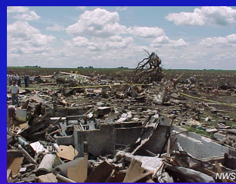
Houses ¾ mile down the road from the Parsons plant were demolished by the tornado. Steel beams from the plant were found nearby.