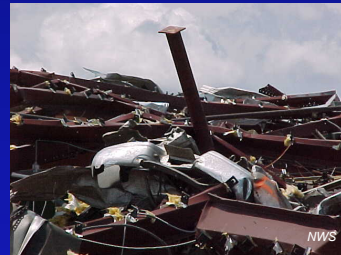
Wreckage from cars in the parking lot was blown into the building by the tornado.

Zero fatalities, and only 3 minor injuries!