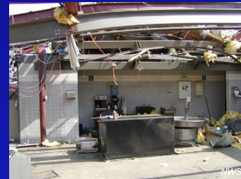
The storm shelters were the only part of the plant to remain intact during the tornado.