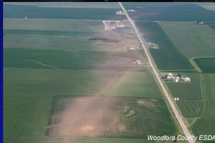
Woodford County ESDA