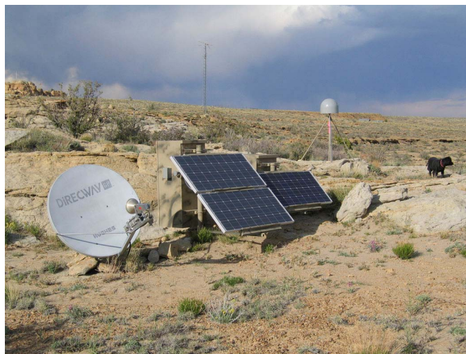
Fig. 2. CORS site P028, located in Chaco Canyon, NM, and established/owned by the Plate Boundary Observatory. Pictured are: satellite dish for data communications, solar panels, equipment housing boxes, and GPS antenna attached to anchored mount.

CORS observation data files consist of GPS code and carrier phase observations, which are provided in the universally recognized Receiver Independent Exchange (RINEX) format. Users retrieving data via the World Wide Web interface have two different options for requesting data –