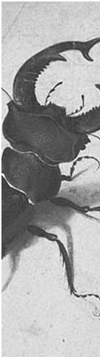
Albrecht Dürer (1471–1528). Stag Beetle (1505) (detail)

Watercolor and gouache; upper left corner added with tip of left antenna painted in by a later hand (14.1 cm × 11.4 cm) The J. Paul Getty Museum, Los Angeles, California, USA