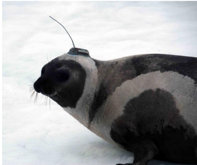
An adult male ribbon seal with a SPLASH tag.

The sampling for each seal typically included length and girth measurements, mass, blood, a small piece of skin for genetics analysis, and any fecal material that was present on the ice, for diet analysis. We obtained 13 blood, 45 skin, and 18 fecal samples from seals that we captured. In addition, we were able to collect 10 fecal samples and 14 samples of skin shed during the molt from seals that escaped our capture attempts. The dark flakes of skin are easy to find in the vicinity of molting seals’ resting sites, and they contain sufficient DNA to support genetic analyses for investigation of stock structure.