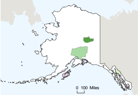
Figure 2b. Percent Change in Core Based Statistical Area Population: April 1, 2000 to July 1, 2008