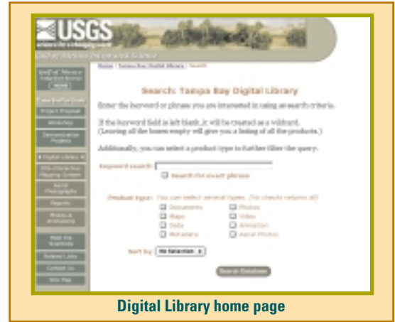
Digital Library home page

When monitoring the health of Tampa Bay, natural resource managers make use of a variety of data such as historical depictions of the estuary, habitat analysis, shoreline change, and biological processes. The digital library centralizes this information on the project website for scientists, natural resource managers, and the public. Users can access comprehensive geological, ecological, and water quality data that is required to make decisions about the future health of the estuary. Information is indexed by keyword and data type allowing visitors to quickly locate resource materials.