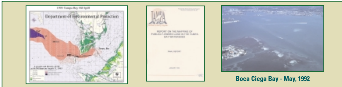
Boca Ciega Bay - May, 1992