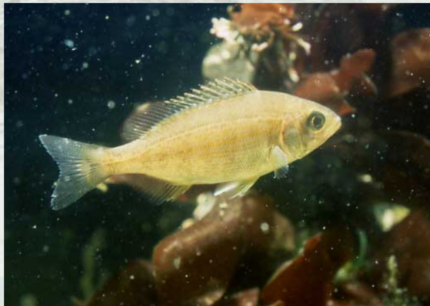
A young Black Sea-Bream Spondyliosoma cantharus

Each month, at least one special marine image will be published from images sent to the BMLSS. This can be of the seashore, undersea world or any aspect of the marine natural world, especially the underwater life, but not restricted to life beneath the waves. Topical inclusions may be included instead of the most meritorious, and images will be limited to the NE Atlantic Ocean and adjoining seas, marine and seashore species and land and seascapes.