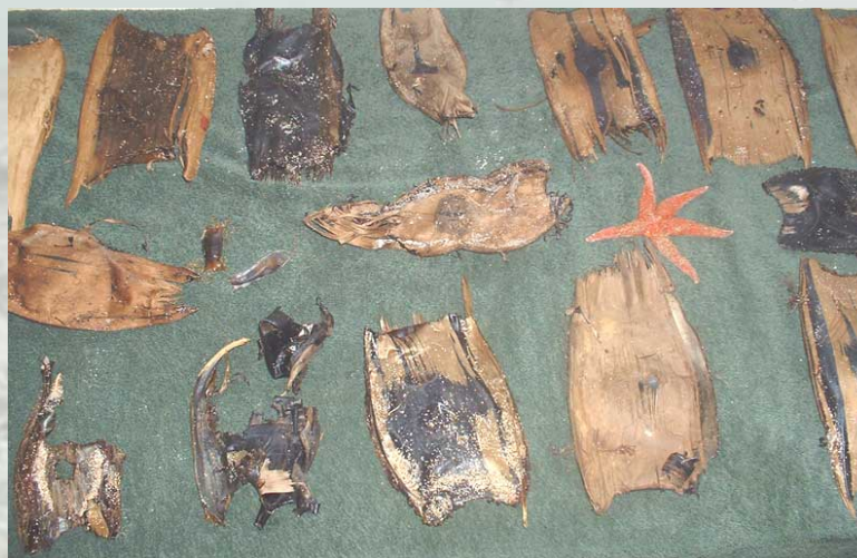
Egg Cases of the Common Skate

Twenty four egg cases of the endangered Skate , Dipturus (=Raja) batis , were discovered on the shore near the Dounreay nuclear power plant , Caithness, west of Thurso and Scrabster Harbour and John o'Groats on the northernmost coast of mainland Scotland, the first records reported to the Shark Trust and the first records on the mainland Scotland since these egg case occurrences have been recorded.