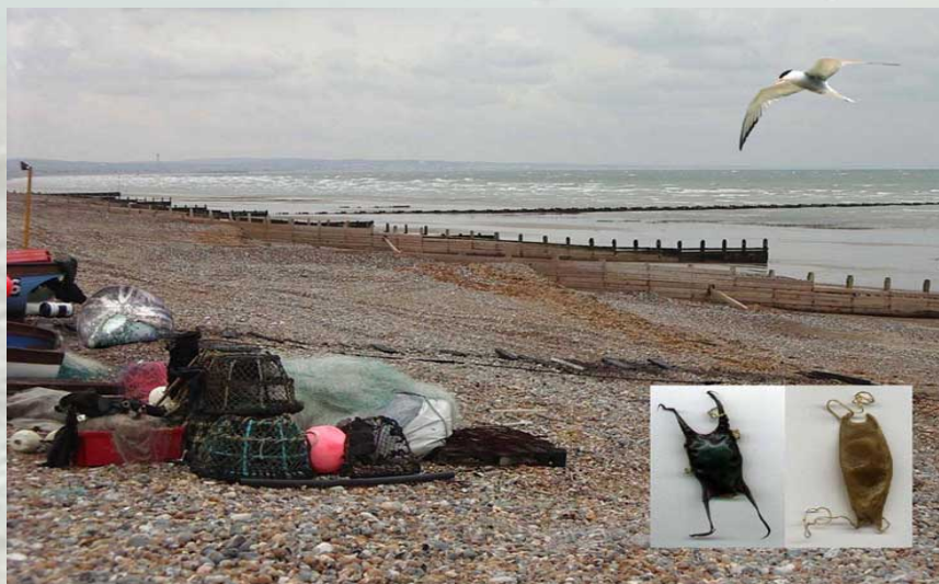
Lancing Beach, West Sussex

The name of the particular coast should be included and the grid reference, if known. Print photographs can be included in Exhibitions and on the BMLSS Web Sites and electronic publications. Electronic images in *.JPG format can also be considered for the web site. They should not exceed 150K in size.