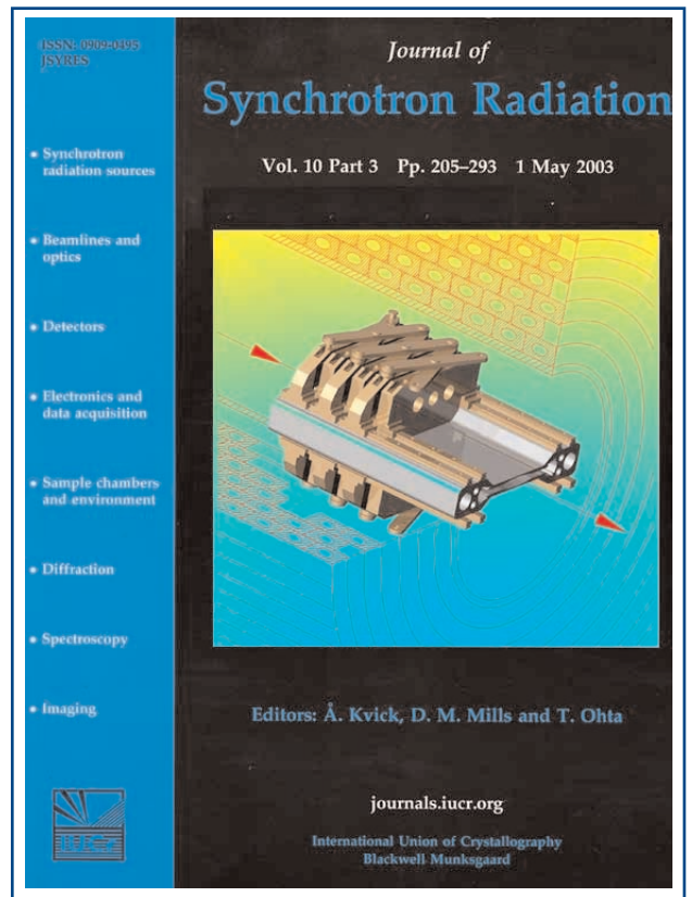
Above: The JSR cover illustration shows a three-dimensional schematic of the driving mechanism for a variable-period undulator placed outside a straight-section vacuum chamber. A section of the magnetic solenoid is also shown.