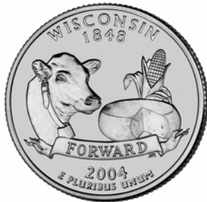
The Wisconsin commemorative quarter-dollar.

In a conference report to Public Law 104-52, enacted November 19, 1995, which created the United States Mint Public Enterprise Fund (PEF), Congress directed the United States Mint to report quarterly on implementation of the PEF. This report is designed to fulfill that requirement.