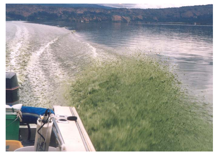
Algal bloom conditions in Upper Klamath Lake.

As a key USGS scientific priority, climate change will be important in western semi-arid landscapes like the Klamath Basin. A variety of data and predictive tools already exist to improve hydrologic forecasts in the Klamath Basin. The challenge will be linking these diverse models and data streams into a single tool. The USGS release of a new flow model, GS-Flow, provides the necessary framework to link these capabilities so managers and researchers can forecast hydrologic responses in the basin on temporal scales of weeks to decades. Model outputs will be linked with habitat suitability curves for endangered species and bioenergetics models of fish growth to predict multiple fish population responses to various hydrologic changes.