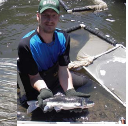
A Lost River sucker captured at the Williamson River weir (bottom left).