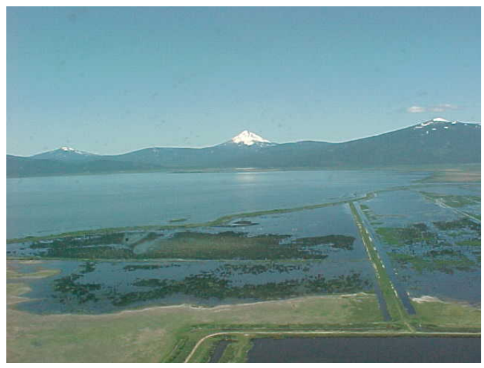
Restoration of the Williamson River Delta on Upper Klamath Lake.

USGS will address pressing science priorities, partly through a process of ecological modeling that incorporates functional linkages, ecological scaling, and large-scale external drivers such as climate change. While research on specific issues needed by resource managers will continue, future investigations will be designed to answer short-term questions that support long-term, large-scale adaptive management of the basin ecosystem.