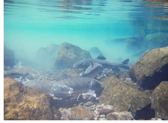
Lost River suckers spawning in nearshore areas of Upper Klamath Lake.

The USGS has established research objectives to answer the critical science needs of federal, state and Tribal stakeholders in the Klamath Basin. These objectives address the impact of human activities on the changing Klamath ecosystem. Moreover, the objectives spring from research forefronts envisioned in the recent USGS publication: "Facing Tomorrow's Challenges: USGS Science in the Coming Decade." They embrace the Department of the Interior's recently released policy and publication: "Adaptive Management Technical Guide" which champions a strong and continuing linkage between science and natural resource decision-making.